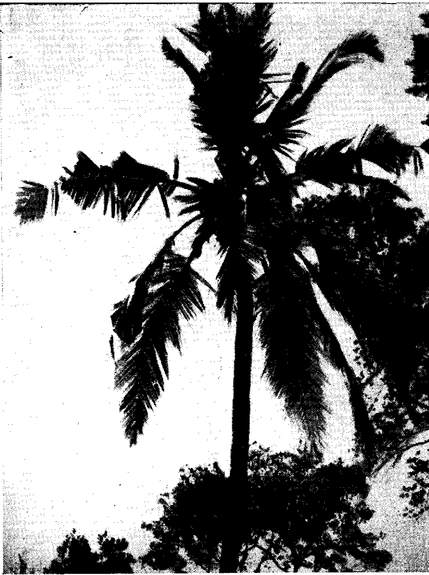
Heavily infested tree