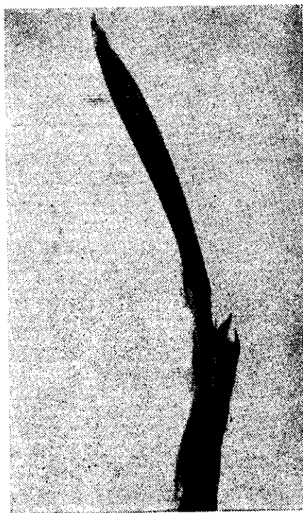
Unopened spathe attacked by beetle

Insecticidal trials have revealed that BHC, Aldrin and Carbaryl at 0.01 per cent concentration can effect satisfactory control of the immature stages of the pest in their breeding sites. Field trials using 0.01 per cent BHC and Aldrin laid out in cultivators' fields showed that the rate of attack of leaves was reduced from 59.7 to 9.4 per cent with BHC and from 58.9 to 5.9 per cent with Aldrin within a period of six years. The resultant increase in yield obtained due to this pest control operation was of the order of 5 to 8 nuts per tree per year.