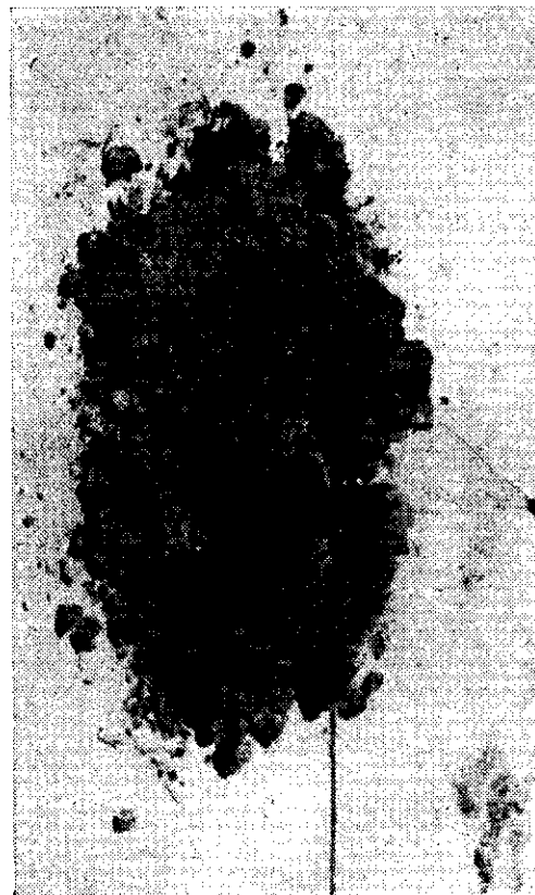
Spraying of breeding material

Elaborate field trials are being conducted in different rainfall tracts of Kerala using BHC and carbaryl to confirm whether the results obtained in Central Kerala would hold good in other tracts as well. Trapping the beetle with insecticide treated breeding material and prophylactic filling of innermost three or four leaf axils with a mixture of 5 per cent BHC and sand in equal proportions have been also proved to be effective measures in reducing pest incidence. An integrated control operation including mechanical, sanitational and chemical methods of beetle control is being tested in an experiment in order to assess the combined efficacy of these operations. Results obtained so far are quite encouraging.