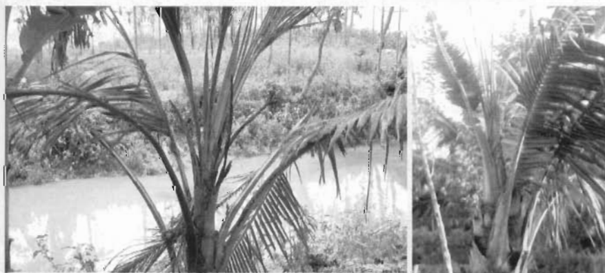
Fig. 1. Symptoms of Crown choke in coconut

Application of borax @50 g per palm for early and middle stage disorder and @100 g per palm for advanced stage disorder at half yearly interval along with recommended dose of fertilizers was the corrective measure adopted.