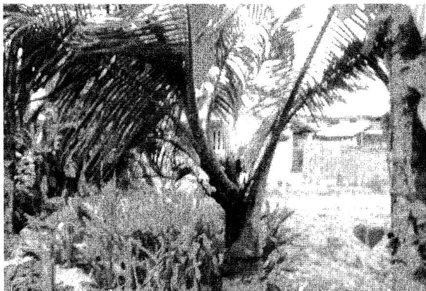
Fig. 2. Coconut recovered from crown choke disorder

observed that, 83.78 per cent respondents had high level of awareness followed by medium (10.81) and poor (5.40) level of awareness about the symptoms of coconut crown choke problem.