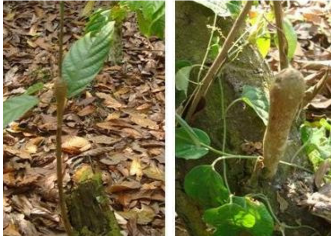
Figure 5. CSSV infected cocoa trees having large stem swellings on rejuvenated stem and chupon.