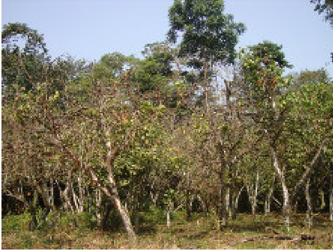
Figure 1. Scores of CSSV-infected trees dying back in new outbreak areas in the Western Region of Ghana. Parts of the said Region now have areas where the disease is so common that it is termed an area of mass infection (AMI).