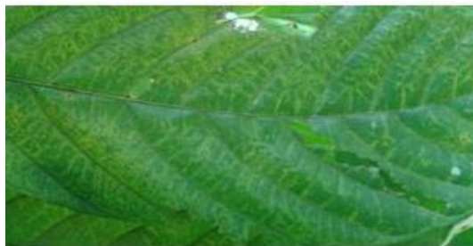
Figure 3. CSSV infected cocoa leaves showing fern pattern form of chlorosis with A clearing along major veins and B green vein banding along major veins.