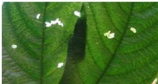
Figure 1. CSSV infected cocoa leaves showing vein clearing.