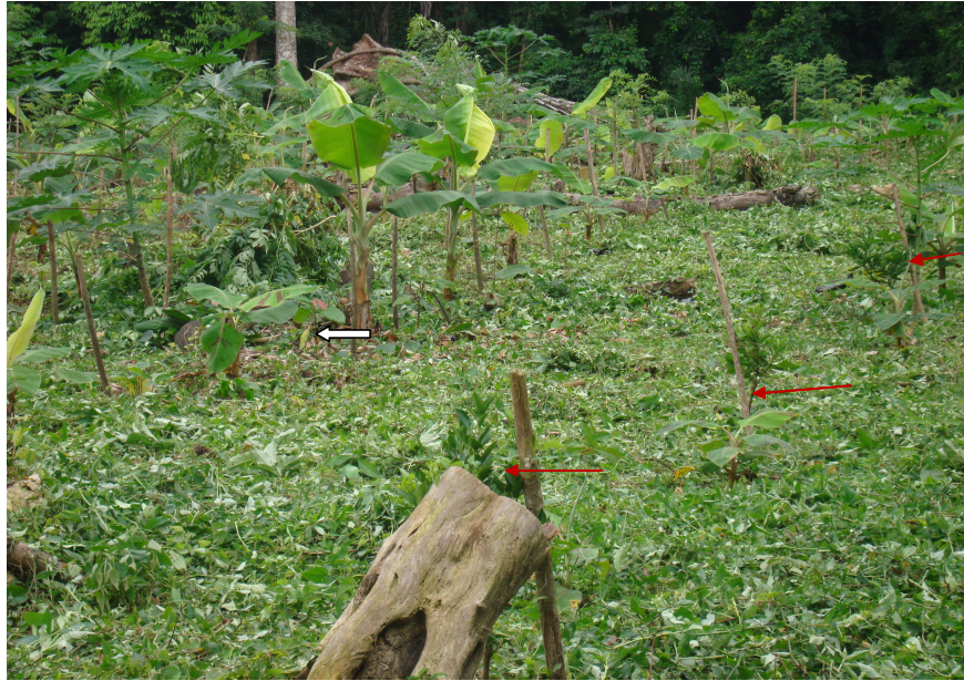
Figure 7. A replanted field having a barrier of citrus crop shown by red arrows and a replanted cocoa tree shown by a white arrow. Shade plants such as plantain, Glicidia and Papaya can also be seen in the background.

Amazons (Attafuah and Glendinning, 1965b) and the emphasis in breeding was switched to selecting for tolerance.