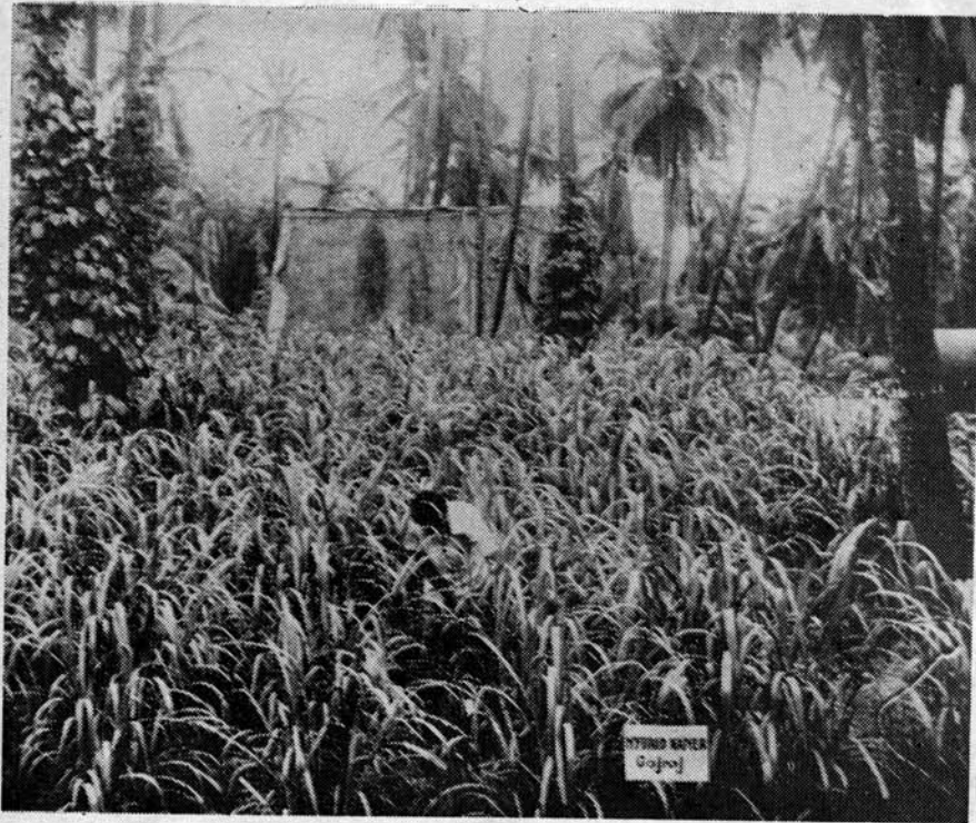
Under coconut trees, hybrid napier 'Gajraj'

sowing, a nitrogen dose of 20 kg/ha is to be given as a starter. Application of nitrogenous fertilizers for legumes is not necessary after subsequent cutting. Brazilian lucerne is a perennial and stands cutting. Fresh sowing is necessary only after a period of three years. In the case of cowpea, harvesting is done at about the flowering stage and the crop allowed to ratoon twice. Harvesting is adjusted for a steady supply of grasses and legumes in the ratio, 3:1 all round the year.