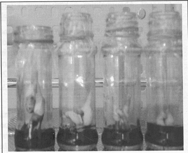
Figure 2. One-month-old twin embryos of VMAC 1 with synchronized germination of twins