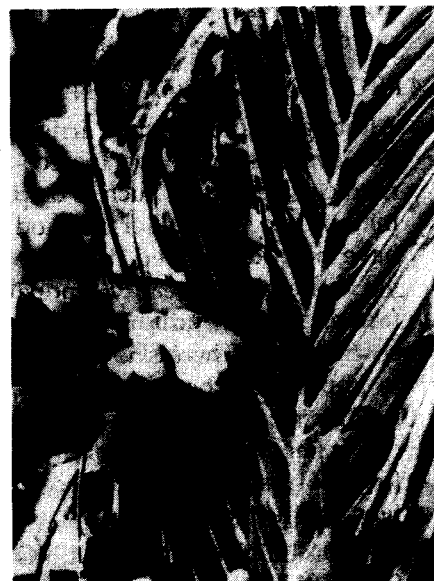
Biological control of leaf eating caterpillar by releasing parasites

The Research System has developed various technologies of production, protection and processing of plantation crops, but much breakthrough has not been achieved in transferring them to the planters in