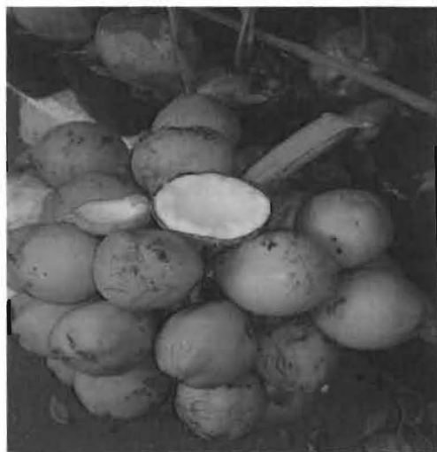
Figure 3. 'Aromatic' x curd coconut hybrid 'Prolific bearing' curd coconut