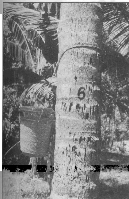
Fig. 2. Pheromone trap

color in bulk quantity and has a characteristic odour. Density of the ferrugineol was 0.785-0.786 g/cc.