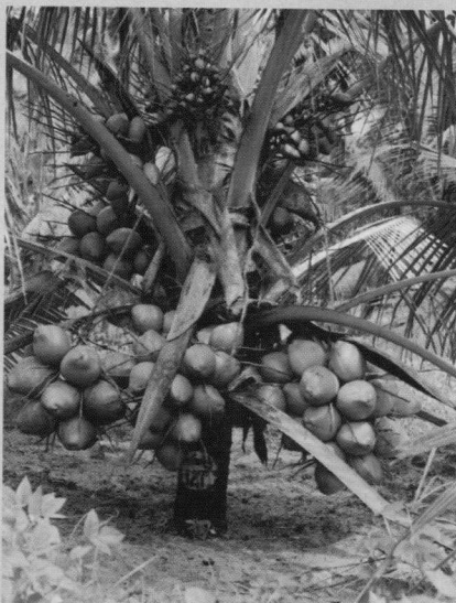
CGD x WCT hybrid

3. Elite progenies from West Coast Tall (WCT) mother palms : In the disease endemic areas, in the midst of highly diseased palms, healthy and high yielding WCT palms (minimum