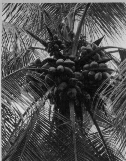
Chowghat green dwarf

In an intensive survey in the disease hot-spots of Alappuzha, Pathanamthitta, Kollam and Kottayam districts in Kerala, 200 CGD palms were observed for root (wilt) disease incidence.