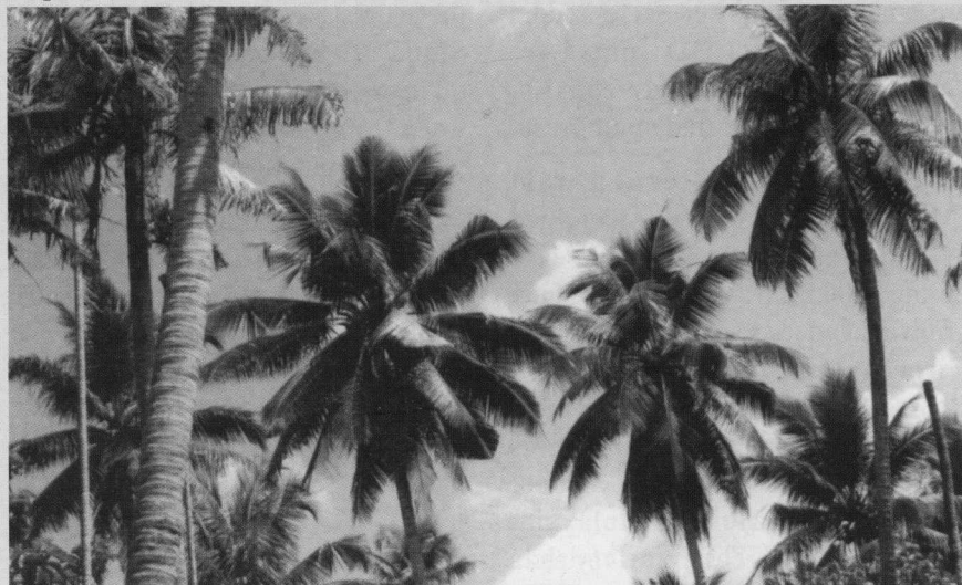
Healthy WCT palm in midst of diseased palms

higher level of resistance to coconut root (wilt) when compared to other varieties. This observation regarding