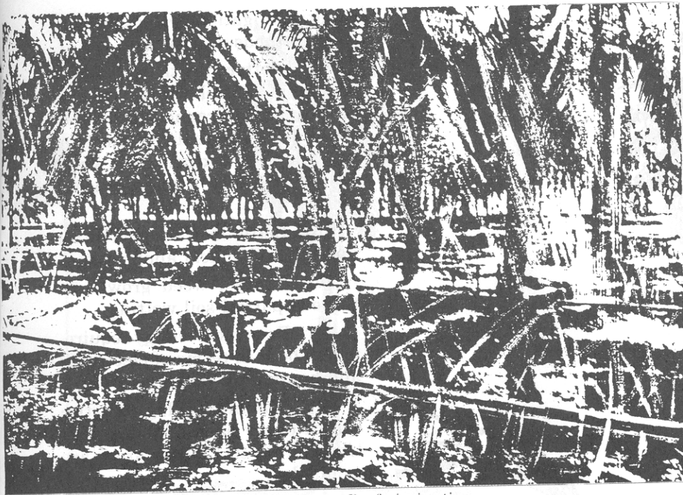
Fig. 1. Perfo irrigation