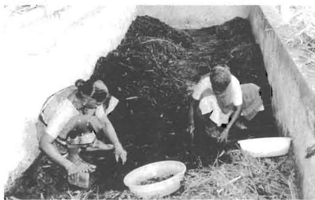
Figure 1. Harvesting of earthworms from coconut leaf vermicompost heap by hand-sorting.

To overcome this issue and enable farmers and entrepreneurs to carry out coconut leaf vermicomposting in a sustainable manner, a simple method based on the push-pull concept was attempted to harvest the earthworms from vermicomposting sites. The push-pull strategy was first introduced in Australia to trap Helicoverpa spp. in cotton by employing an insect repelling and attractant agents 6 . Later it was adopted by Rothamsted Research, UK as a business strategy for insect management based on chemical ecology principle 7 . This strategy was extended to coconut leaf vermicomposting technology to harvest earthworms from vermicompost heaps, by employing integrated use of volatiles released by biological materials such as mustard solution and cow dung as forces of repulsion and attraction respectively. In addition, a more simplified pull-pull approach was also found successful.