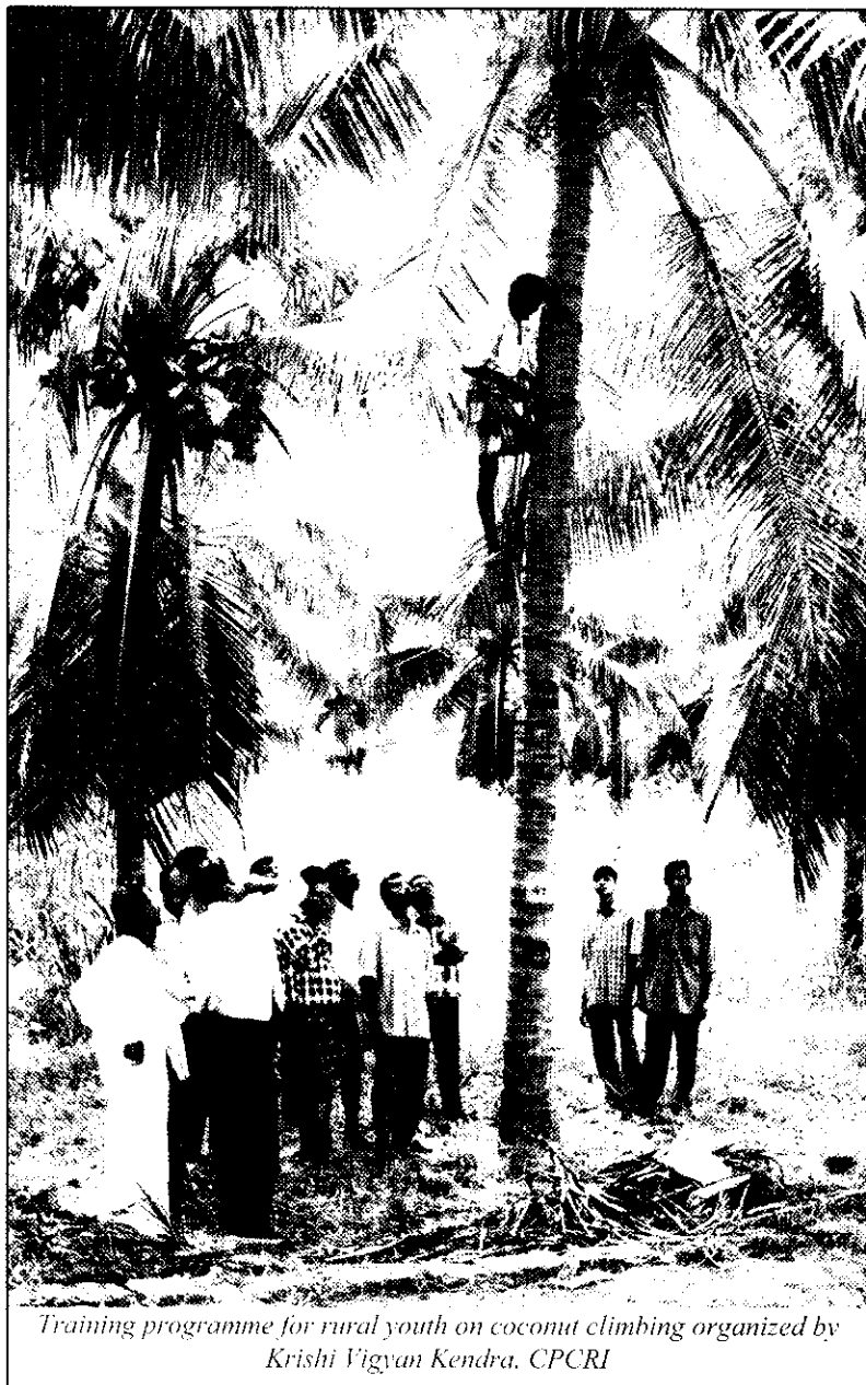
Training programme for rural youth on coconut climbing organized by Krishi Vigyan Kendra, CPCRI

It was a challenge to the technology developers to fabricate a simple, safe and easy to use device for climbing coconut palms, which could even be operated by an unskilled person. It was in this background that a competition was held for