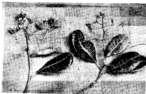
FIG. 2 (b). Initial and advanced stages of the blight.

could be isolated only from old scabby lesions and not from small young lesions indicated that the fungi isolated from the blight affected inflorescence were only secondary saprophytic colonizers which are non-pathogenic. Working with H. bergrothi Reut., infesting mango, Leach (1945) found that "no organism