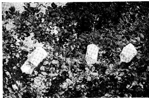
FIG. 1. Inflorescences bagged with cylindrical cages of muslin cloth.

Cashew Plantations, Periyar (Kerala). Inflorescences in situ on trees, either injured by pinpricks or uninjured, were inoculated with fungi by spraying spore or mycelial suspensions with glass atomizer. Soon after inoculation, the inflorescences were covered with cylindrical cages of muslin cloth (Fig. 1). Cages were kept moistened to ensure proper humidity inside. Young healthy inflorescences were caged and three adult bugs