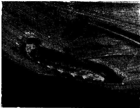
FIG. 2 U. folus caterpillar