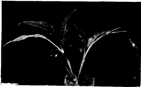
FIG. 1 Turmeric plant infested by U. folus caterpillars.