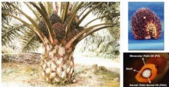
Figure 1 Young oil palm with fruit bunches. Upper insert: Mature bunch; lower insert: cross-section of mature fruit showing separate sources of palm oil from the mesocarp and palm kernel oil from the endosperm or kernel.

large-scale planting compared to E. guineensis . This is partly due to the very low yield despite the high quality of the oil. However, E. oleifera may play a very important role in the future with respect to interspecific hybridization and biotechnology.