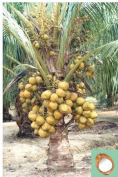
Figure 4 Young coconut palm showing high yield, precocity and early bearing.

Coconut is a perennial monocotyledon ( 2n = 32 ). It produces adventitious roots at the base of the stem with a prominent bole as it grows older (Figure 4). The palm has a single terminal meristem producing 30–45 fronds on the top of its stem. Generally there are three types of coconut, namely tall, dwarf, and their hybrids.