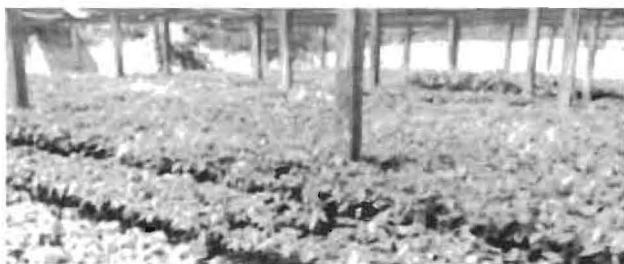
Fig.3. Quality seedlings