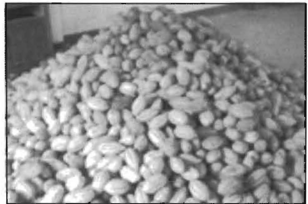
Fig.2. Seed pod