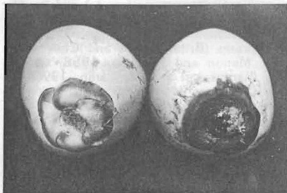
Figure 4 Fruit rot symptoms at the stalk end on artificial inoculation (left — control)

The fungus L. theobromae has been reported as an ubiquitous pathogen; in coconut, its involvement in root (Menon and Pandalai, 1958) and leaf (Warwick et al. , 1993) diseases is known. The fungus causing coconut fruit (nut) rot has been recorded in Brunei, Indonesia, and Vietnam (Johnston, 1965). In India, it has been reported to occur on seed coconuts (Raju, 1984; Raju and Reddy, 1984). In the present study, incidence of fruit rot in immature nuts of coconut and the pathological role of L. theobromae in the disease is elucidated. The extent of occurrence of the disease and its impact on yield are still to be determined. It is possible that under specific conditions, L. theobromae gains entry into the developing nuts leading to the disease.