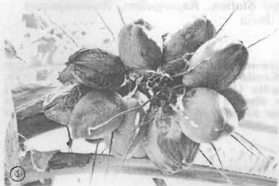
Figure 1 Fruit rot symptoms — naturally infected coconut bunch

undulated margins, mainly starting from the apex of the nuts. The lesions progressed covering a larger area of the nut, finally involving the entire nut. The affected nuts were desiccated, shrunk, and deformed. In some cases, the contents leaked owing to the splitting of such nuts (Figures 1 and 2). Since the infection usually originated from the apex, the nuts remained attached to the bunches. When cut open, the infected nuts revealed extensive rotting of the epicarp which spread to meso- and endocarps as well, especially in 6-8 month-old nuts.