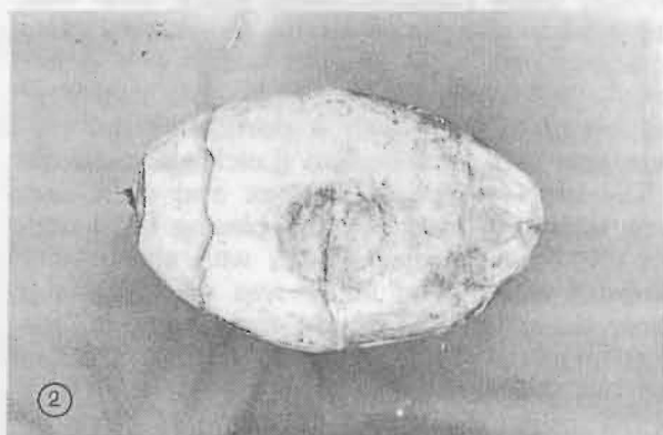
Figure 2 Fruit rot symptoms — naturally infected nut

The fungus cultured from affected nuts was identified as Lasiodiplodia theobromae (Pat.) Griffon and Maubl. (IMI 370516), formerly known as Botryodiplodia theobromae . It did not sporulate readily in the culture medium. In scrapings from the surface of naturally infected nuts, Colletotrichum gloeosporioides , Chlamydomyces palmarum , and Fusarium sp. were also observed. However, in isolations, only L. theobromae was obtained in culture, and hence, tested for pathogenicity.