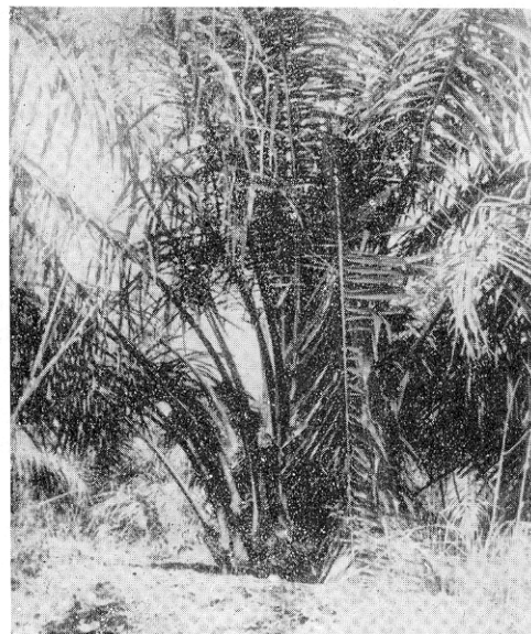
Fig. 1. Typical symptom of beetle damage in five year old oil palm

causing severe damage to emerged fronds and spindles. The adult beetles feed on the softer tissues of the rachis of the younger fronds and petioles of the unopened spears resulting in snapping off the fronds and spears at the feeding site (Fig. 1). Among the fronds beetle bores into the rachis, 1 to 2.5 m away from the leaf base; and in the spindle it tunnels into the petiole at the base of the spear cluster. In oil palm, unlike in coconut palm, incidence of wedge-