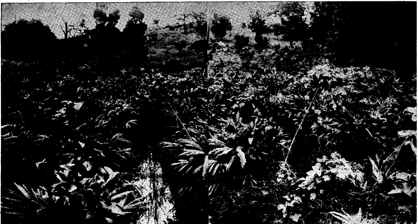
An open ravine planted up with cardamom with murikku cuttings planted for temporary shade. On the extreme left, karana saplings have been planted for permanent shade

(4) The cardamom areas in Coorg where the