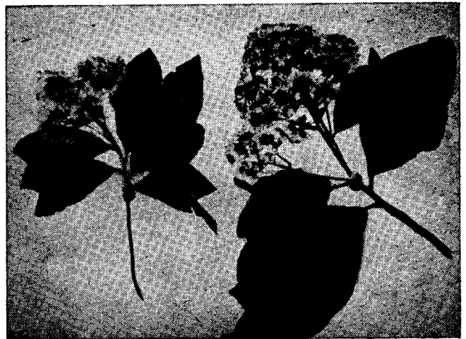
Flower-heads of karana . Note the characteristic flowers

In very recent times, cardamom growers of the Cardamom Hills of Travancore have been rapidly solving this problem by planting seedlings of karana tree wherever sufficient shade is required to be rapidly built up. The