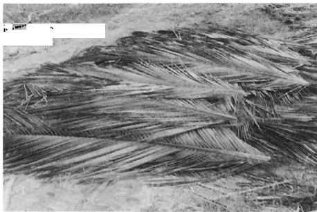
Coconut leaves collected for vermicompost preparation

Application of organic manures is a vital component of sustainable crop production practices. Therefore it is necessary to make full use of natural resources available. It is estimated that on an average six to eight tonnes of dry coconut leaves are available from one hectare of well