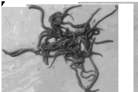
Earthworms for composting coconut leaves

vermicompost improves soil aeration, water holding capacity and root growth. The major steps involved in large scale vermicomposting are as follows: