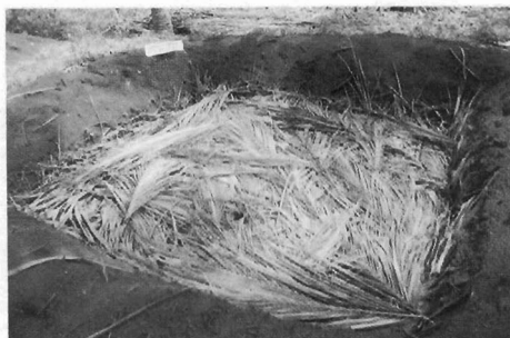
Pit method of preparation of vermicompost

Composting can be done in pits, thatched shed or cement tank. The length and breadth of the vermicompost unit in tank or pit can be made as per convenience. But the depth should be less than one metre. For compost preparation, coconut leaves weathered for 2-3 months are to be used. The leaves can be used as such or after chopping into pieces. Vermicomposting can be done in the coconut palm basin also. As the earthworms prefer organic matter in the initial stages of decomposition, the collected coconut leaves are to be treated with cowdung slurry@100kg