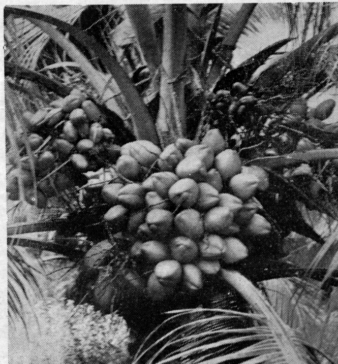
'Laccadive' X 'Gangabondam' — a heavy bearer