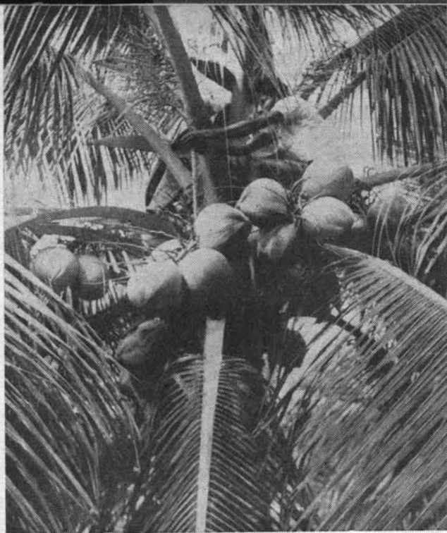
'San Ramon' — big in size, few in number

Selection—an Essential Practice. It would take a few more years to produce enough planting material of proved introductions. Till then one has to select the best planting material from the locally popular cultivars and thus improve the yield to a certain extent.