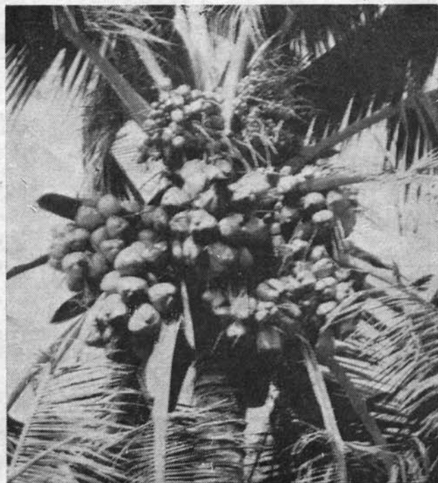
'Laccadive Micro' — large number of nuts

Because of the high yield, early flowering and disease tolerance, the demand for these hybrids has increased