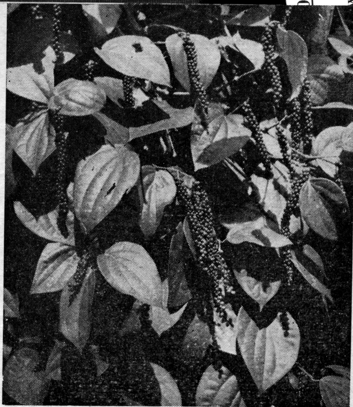
Pepper 'Panniyur 1'

There are two varieties of cacao—'Criollo' and 'Forestero'. Though 'Criollos' were planted on a large scale in the earlier years, it was later realised that 'Forestero' would perform better under the Indian conditions. The cacao breeding activities were mainly confined to the assemblage of material from different sources. The Central Plantation Crops Research Institute has assem-