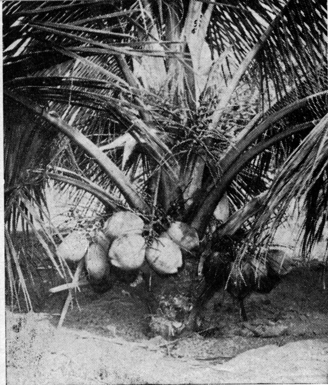
A 'DXT' hybrid — initial years of bearing

considerably during the past few years. It has become impossible to meet this heavy demand by the conventional methods of hybrid production. The seednuts should be produced by the Research Institutes of similar agencies every year as it is not advisable to use nuts collected from the hybrids as seednuts. Isolated elite seed gardens now established by various State Governments and Research Institutes would be the ideal solution to the problem of scarcity of hybrid seednuts. In these gardens the parents are planted in alternate rows and by proper emasculation followed by natural hybridization a larger number of hybrids can be produced at a lower cost.