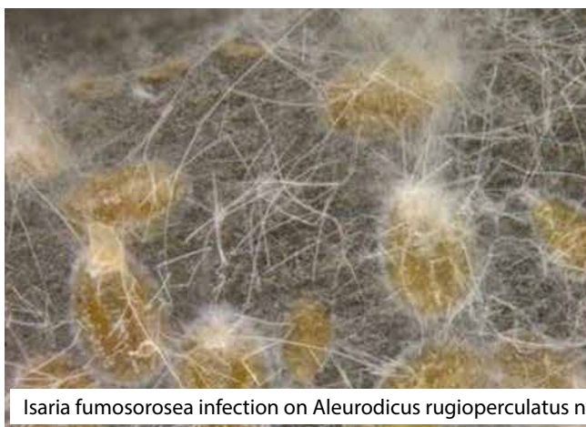
Isaria fumosorosea infection on Aleurodicus rugioperculatus nymphs and adult