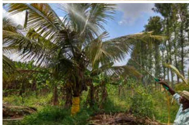
Foliar application of I. fumosorosea on coconut

management of this invasive whitefly on coconut and other crops. Beside supply of isolate, hands on training on cost effective mass production techniques was provided to different stakeholders and farmers, department officials. Besides, ICAR-NBAIR initiated extensive studies on effective and ideal formulation technology for this entomopathogen for higher bio-efficiency, long shelf-life, and higher persistence with financial assistance from Coconut Development Board, Kochi. ■