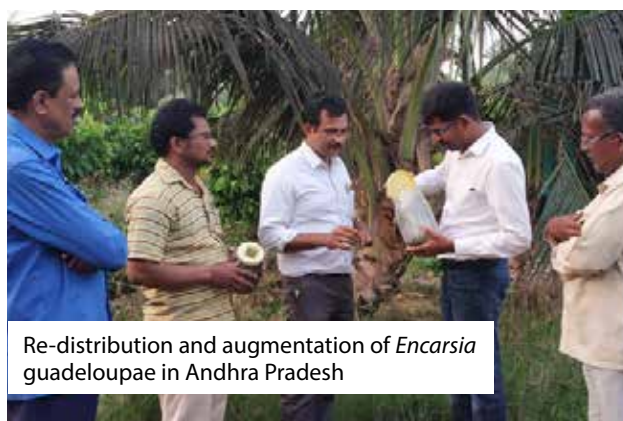
Re-distribution and augmentation of Encarsia guadeloupae in Andhra Pradesh

percent reduction. To integrate the I. fumosorosea with E. guadeloupae to develop the bio-intensive pest management, the effect of this fungus on development of E. guadeloupae in RSW nymphs and adults were assessed.