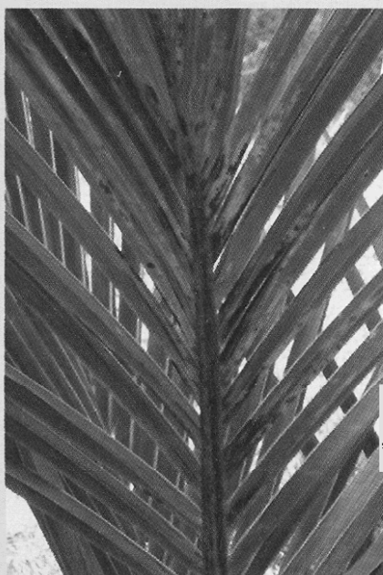
Leaf blight caused by L. theobromae

In coconut seedlings and leaflets of grown up palms spindle shaped necrotic spots appear on lower leaves. The spots enlarge and coalesce causing blighting of leaves. In seedlings, eventually the disease causes mortality. In adult palms, the leaves in the lower whorls dry and droop followed by the leaves in the upper whorl.