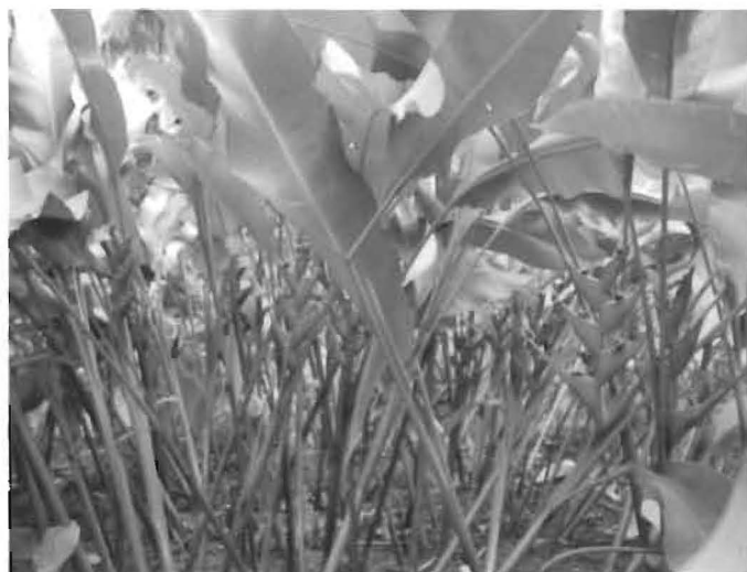
Symptoms of K deficiency