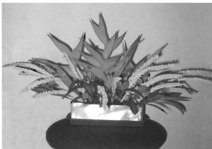
Heliconias are excellent for decoration

leaves are stripped off and top most leaf blades are cut leaving the petiole. They are used in stage decorations, bouquet making, long arrangements etc. The vase-life of inflorescences is 10-12 days. Inflorescences of around 1 m length and 9 cm stem girth with two or more open bracts are selected for sale. Smaller inflorescences can be used for value-addition such as bouquets and table top arrangements. In order to remove the field heat, the cut end of the inflorescence stem is dipped in tap water for about an hour. These are then washed in water for removing soil and dust. The excess water is wiped off and inflorescences are graded based on their length. Inflorescence with fewer flowers inside the bracts are ideal for marketing as it reduces time and cost of cleaning and minimize occurrence of insects, odours from water accumulation and organic matter deterioration. At least 4-5 marketable inflorescences are produced in the first year of planting itself. It produces 45-50 inflorescences/clump/year in the subsequent years. It needs to be replanted after 3-4 years.