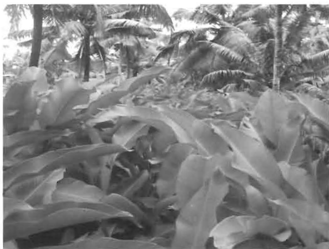
Grading of flowers

Seven months old rhizomes with collar girth of more than nine centimetre can be used as planting material. After removing the leaves, rhizomes cut back at 1 m