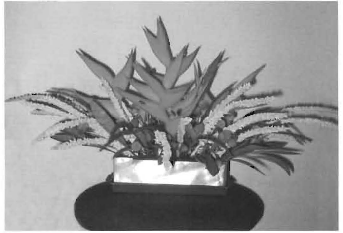
Heliconias are excellent for decoration

leaves are stripped off and top most leaf blades are cut leaving the petiole. They are used in stage decorations, bouquet making, long arrangements etc. The vase-life of inflorescences is 10-12 days. Inflorescences of around 1 m length and 9 cm stem girth with two or more open bracts are selected for sale. Smaller inflorescences can be used for value-addition such as bouquets and table top arrangements. In order to remove the field heat, the cut end of the inflorescence stem is dipped in tap water for about an hour. These are then washed in water for removing soil and dust. The excess water is wiped off and inflorescences are graded based on their length. Inflorescence with fewer flowers inside the bracts are ideal for marketing as it reduces time and cost of cleaning and minimize occurrence of insects, odours from water accumulation and organic matter deterioration. At least 4-5 marketable inflorescences are produced in the first year of planting itself. It produces 45-50 inflorescences/clump/year in the subsequent years. It needs to be replanted after 3-4 years.