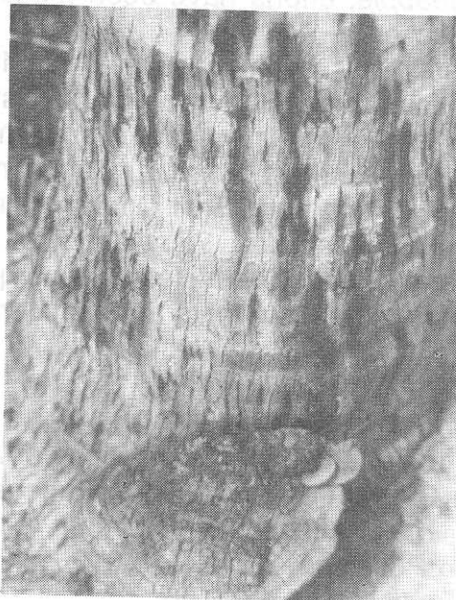
Vertical streaks with brown discoloration at the base of stem. Bracket of fungal pathogen is also seen