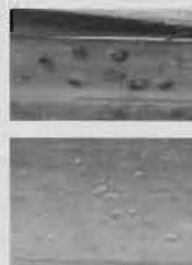
Brown soft scale, Coccus hesperidum