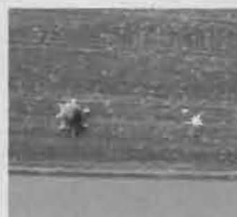
Stellate scale, Vinsonia stellifera