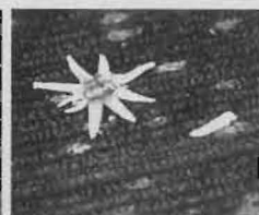
Nymph with rays and anal tufts