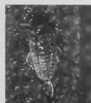
Crawler with appendages