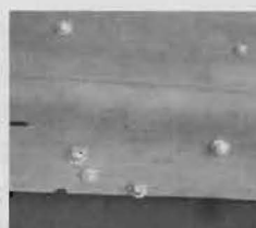
Wax scale, Ceroplastes floridensis