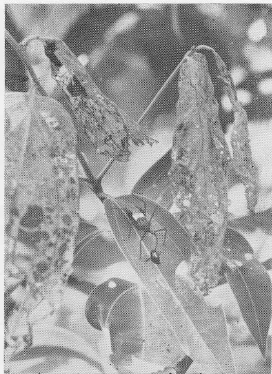
Fig. 4. The Reduvild bug Synanus collaris predaceous on the leaf beetle Singhala helleri .