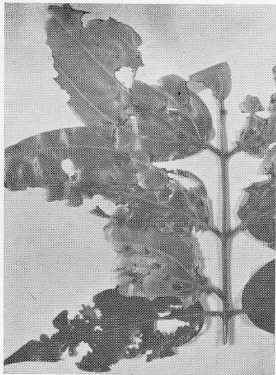
Fig. 3. Cinnamon leaves damaged by caterpillars of leaf miner Acrocercops sp.