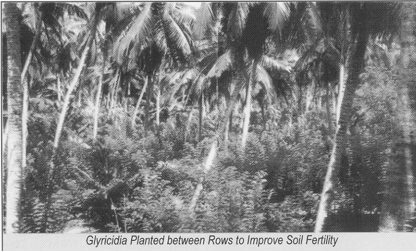
Glyricidia Planted between Rows to Improve Soil Fertility