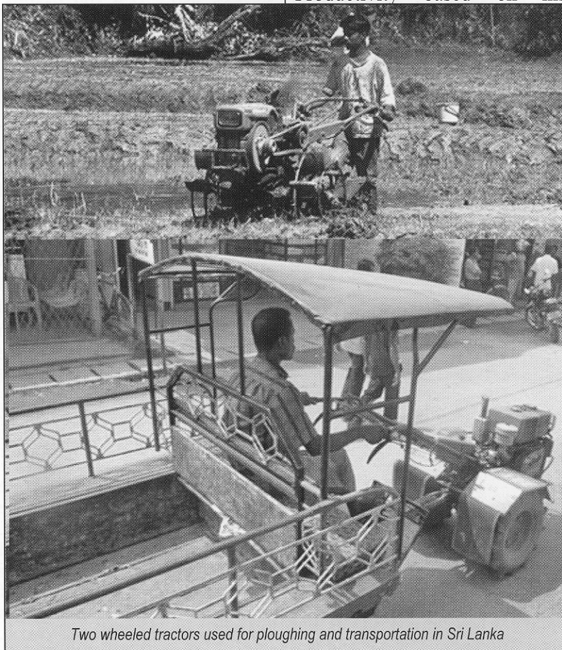
Two wheeled tractors used for ploughing and transportation in Sri Lanka