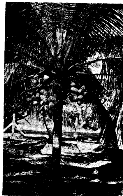
Fig. 2. Chowghat Dwarf Orange

In 1960, seedlings of the three dwarf forms - yellow, red and green - were obtained from the New Ambady Estate and planted at the Central Plantation Crops Research Institute, Kasaragod, Kerala. Though these palms were raised under rainfed conditions earlier, since 1972 they are being irrigated as some multi level cropping trials are laid out in this plot. In 1965 a few seedlings of Malayan Dwarf Yellow, Red and Green forms raised from seednuts directly introduced from Malaysia were planted in another plot in the same block and raised under