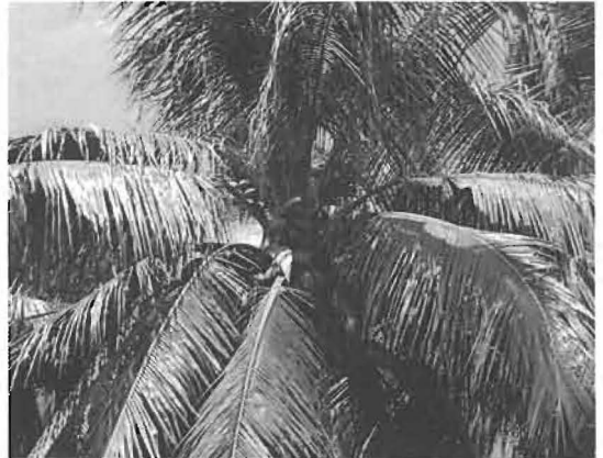
Figure 2. Shape of the crown in Sri Lanka Tall coconut