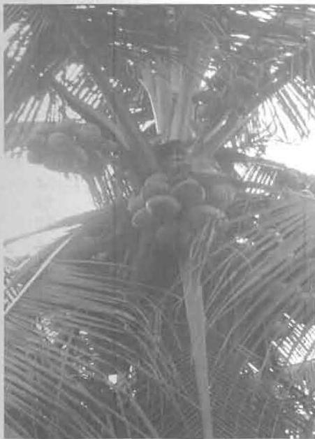
Figure 1. Nuts of Sri Lanka Tall coconut

coconut (1995). All the accessions are categorized under Sri Lanka Tall variety (Figures 1 and 2) collected randomly covering different geographical locations except Clovis and Margaret were collected bias sampling method. The plants were 25-30 years of age at the time of data recording and were managed with average standard management practices for coconut. Bunch wise nut yield was recorded in all the coconut phenotypes in the 6 most mature bunches in 25 randomly selected palms from each accession. A total of 40 nuts from each coconut phenotype were sampled as 2 nuts from a palm. Sampled nuts were subjected to fruit component analysis and weights of fresh nut (FW), husked nut (HNW), split nut (SNW) and kernel (KW) were recorded and the fruit components husk weight (HW), water weight (WW) and shell weight (SW) of each nut were derived from the scored data. The data were analyzed using analysis of variance and general linear models procedure followed by mean separation procedures Duncan's multiple range test and least squares using statistical software package SAS version 8 and Minitab version 17 used for principal component analysis, distance matrix, correlation matrix, cluster analysis and dendrogram based on squared Euclidean distances.