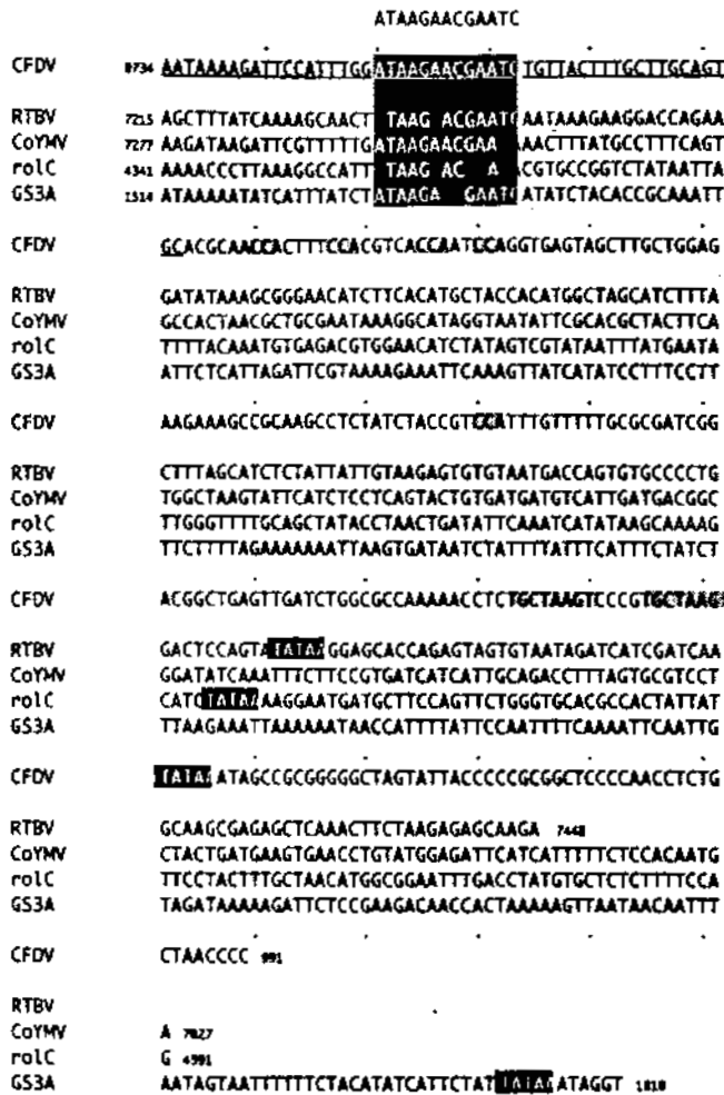
Fig. 3. Sequence comparison of the CFDV promoter region determining phloem specificity with promoter sequences of other phloem-specific promoters. Sequence comparison of CFDV CF5 to the promoter regions of the rice tungro bacilliform virus (RTBV) promoter (Yin et al. , 1997), Commelina yellow mottle virus (Medberry et al. , 1993), the ro1C gene of Agrobacterium rhizogenes (Kiyokawa et al. , 1994) and the pea glutamine synthase GS3A gene (Brears et al. , 1991). The 52 bp region (Fig. 1A) of CFDV is underlined. Homologies between all promoters are shaded (grey box). The dotted boxes highlight the repeated sequences CCA or TGCTAAGT. The TATA boxes are shown as black boxes.

is 1.1 times more efficient than a simple 35S promoter (Tacke et al. , 1990). A further property of the CFDV promoter is noteworthy, namely its high activity in prokaryotic cells. As compared to CaMV 35S promoter activity in bacteria (Assaad & Signer, 1990; Fig. 1C), pRTCF4 as the most active CFDV promoter construct is more than 40 times more efficient. The Chlorella virus adenine methyltransferase gene promoter has also been demonstrated to be a strong promoter in plants and bacteria (Mitra et al. , 1994; Mitra & Higgins, 1994). In contrast to CFDV, however, its activity in plants is not limited to the phloem, but can be detected in leaves, stems and flowers.