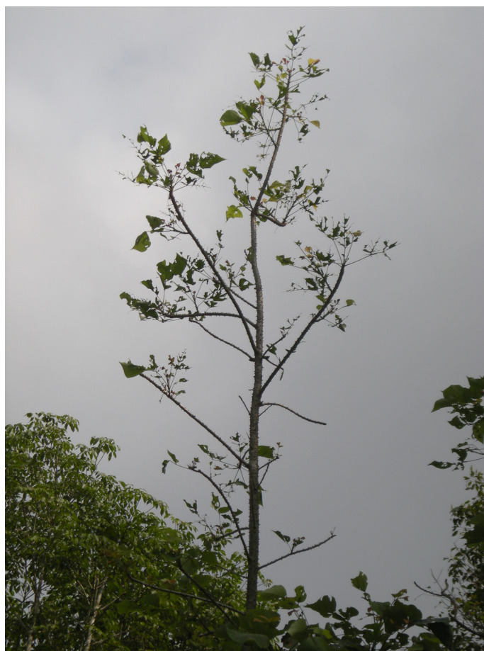
Fig. 2. Erythrina indica tree (~ 8 m tall) showing A. miliaris feeding damage. In south India this tree is pruned to 3-4 m and then used to support and shade black pepper vines. Although the grasshoppers will feed readily on E. indica , they generally do not feed on the black pepper vines.

In this context, the recent occurrence of A. miliaris in high altitudes of the Idukki district, Kerala, south India presents a dilemma as to whether a conservation or suppression strategy should be employed for this species. A. miliaris was reported from different upland forest areas in this district in 1983, 1994, 2003, 2005 and 2008 in rela-