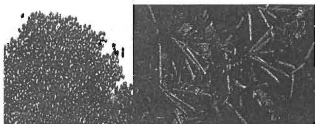
Fig. 1: Seeds and Pods of Indigofera tinctoria