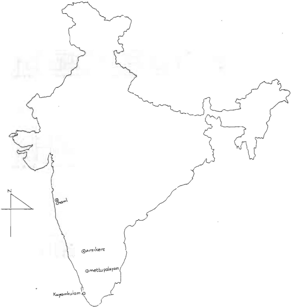
Fig 1 Map of India showing areas from where populations collected