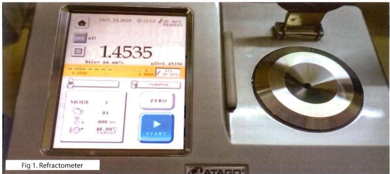
Fig 1. Refractometer

According to FSSAI (2015), refractive index is defined as the ratio of velocity of light in vacuum to the velocity of light in the oil or fat or it is described as the ratio between the sine of angle of incidence to the sine of angle of refraction. Refractive index of the samples can be measured by using a suitable refractometer. FSSAI standard for refractive index of coconut oil at 40°C is 1.4481-1.4491.