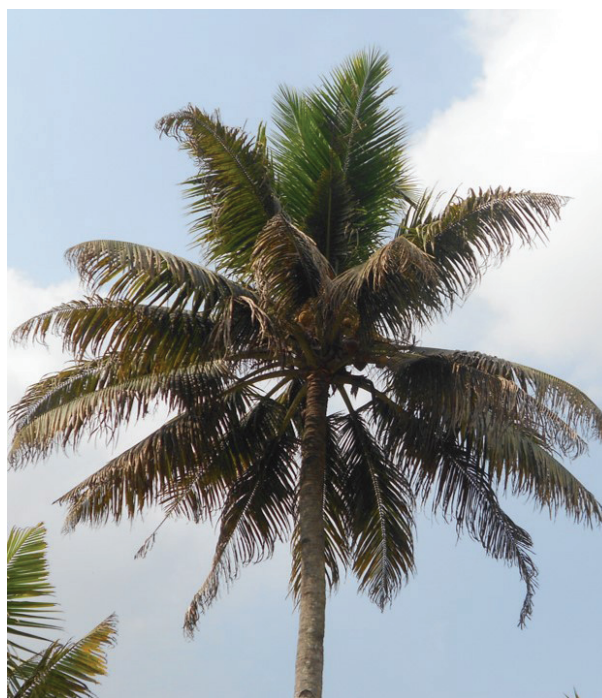
Fig. 2. Root (wilt) disease affected coconut palm