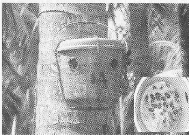
Fig. 4. Arrangement of red palm weevil trap

When the pre-and post-infestation levels were observed in the gardens and the villages in which experiment was conducted, the dead palms percentage has come down from 2.4 to 0.5 (79 % decrease) and 1.5 to 0.1 (99.99 % decrease) in both the gardens. The level of pest incidence in the respective villages as a whole