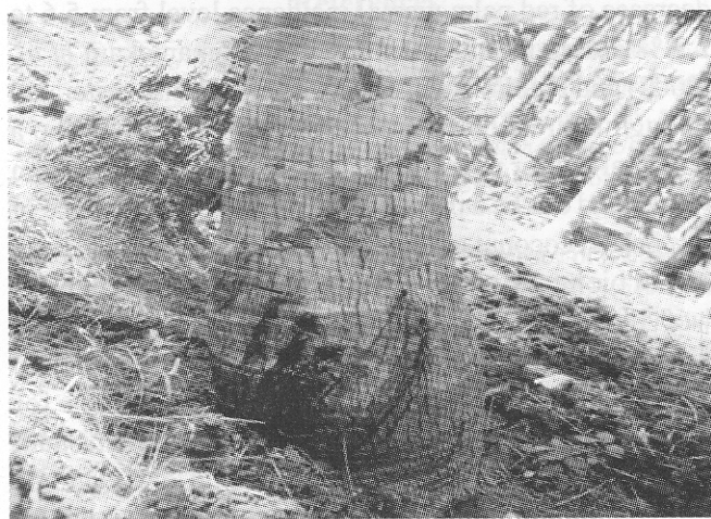
Fig. 3. Recovery of the palm after root feeding (after two years)

'azadirachtin' i.e., an active ingredient content in neem seeds which varies from 0.19 to 0.92 % was well established by many workers under varied conditions. Satya Vir (2007) in his studies highlighted the growth regulatory effects of neem bio pesticide on pests like