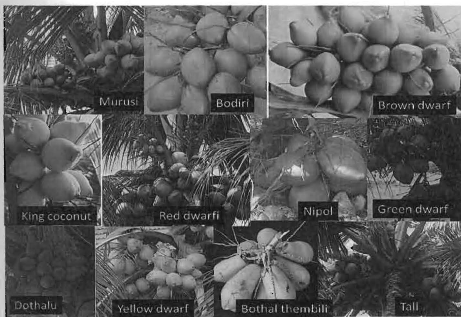
Figure 01. Coconut forms used as tender nut beverage in Sri Lanka

* Nipol is a natural hybrid between King coconut and Sri Lanka tall