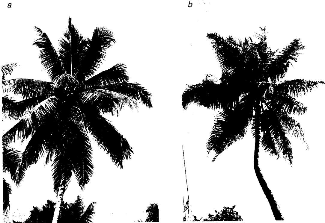
Figure 1. A healthy coconut palm (a) and a root (wilt)-diseased coconut palm (b) (West Coast Tall variety).