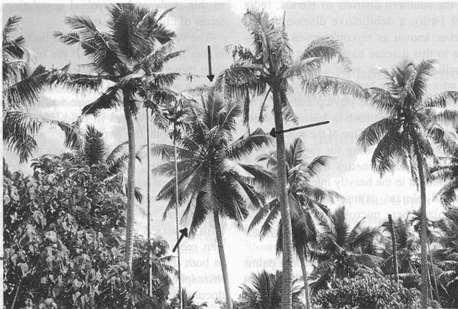
Figure 2. A field-tolerant coconut palm growing amidst heavily diseased root (wilt)-affected palms (shown by arrows).

The phosphate solubilizing microbes were found to be on par in both types of palms, their population being higher at 25–50 cm depth of the soil. Preponderance of free-living N_2 -fixers in the rhizosphere of field-tolerant palms and similarity in phosphate solubilizers population in both types of palms, corroborate the observations made earlier by Potty et al. 17 in their studies on changes in soil