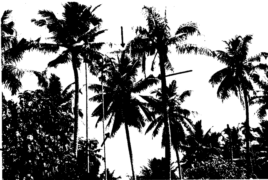
Figure 2. A field-tolerant coconut palm growing amidst heavily diseased root (wilt)-affected palms (shown by arrows).

The phosphate solubilizing microbes were found to be on par in both types of palms, their population being higher at 25–50 cm depth of the soil. Preponderance of free-living N_2 -fixers in the rhizosphere of field-tolerant palms and similarity in phosphate solubilizers population in both types of palms, corroborate the observations made earlier by Potty et al. 17 in their studies on changes in soil