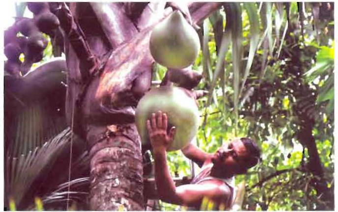
Adult palm with fruits

unique in the plant kingdom in caring for the seedlings after they germinate. Seedlings benefit from growing in the shadow of the parent, because they have access to the more nutritious soil there. In increasingly humid conditions on Seychelles, strong selection for plants with the tallest seedlings happens and such seedlings establish successfully under the low light conditions. As a result, juvenile plants can reach a height of 15 m and hold their foliage in the forest canopy. This capacity to produce such an enormous juvenile plant is related in part to the large food reserves in the seed.