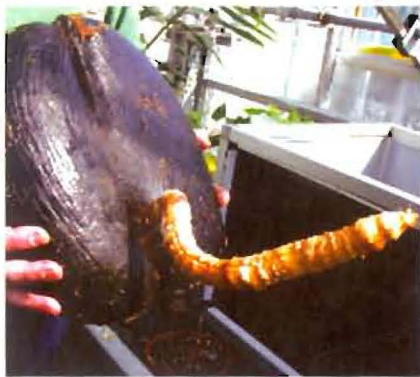
Germinating shoot of Lodoicea maldivica

The seeds appear to have no mechanism for dispersal, as the heavy nuts sink in water and the flattened shape prevents it from rolling off to a long-distance through the sea. This might be the reason why the palms are found in very limited natural habitats and the name sea coconut. The tough fibrous mesocarp is important in allowing the seed to fall unharmed, even upon a rock. In natural populations, female trees typically bear 2-9 developing nuts across several inflorescences at a time though cultivated trees can bear as many as 60 nuts.