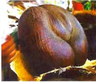
Freshly dehusked seed of Lodoicea maldivica