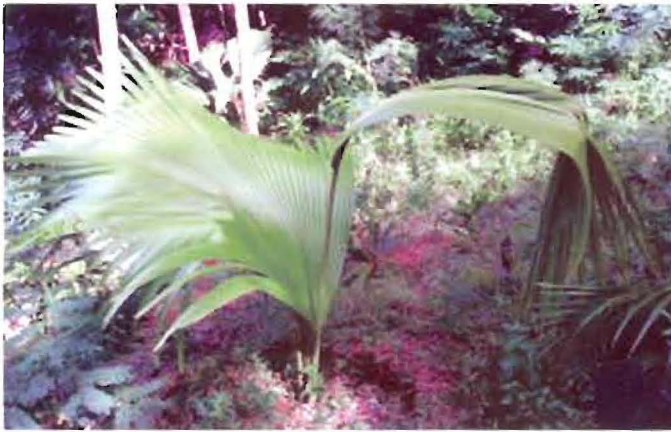
Seedling of Lodoicea maldivica