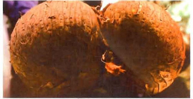
Seed of Lodoicea maldivica

diameter. The mature inflorescences of double coconut have the aroma of honey and these flowers are pollinated by endemic lizards like gecko which inhabits the natural habitat of the palms. Probably pollination by wind and rain are also important.