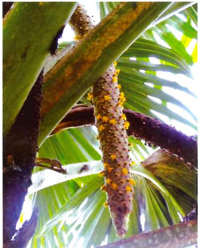
Male Inflorescence of Lodoicea maldivica

The palm is dioecious, with the male plant growing 25-35 m tall and the females shorter with an approximate height of 20 m. The male inflorescences are massive, catkin-like spikes 1.2-1.8 m long and 8-10 cm wide and are usually unbranched. These spikes are packed with male flowers which are spirally arranged clusters of 60-70 flowers within deep pit-like structures formed by leathery modified bracts. The female spikes are similar in size to those of the male and bear 5-13 flowers of about 5 cm in