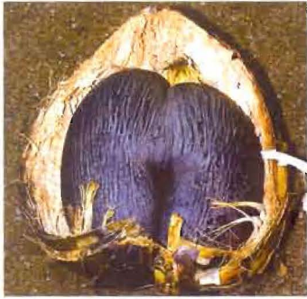
Half husked double coconut with seed