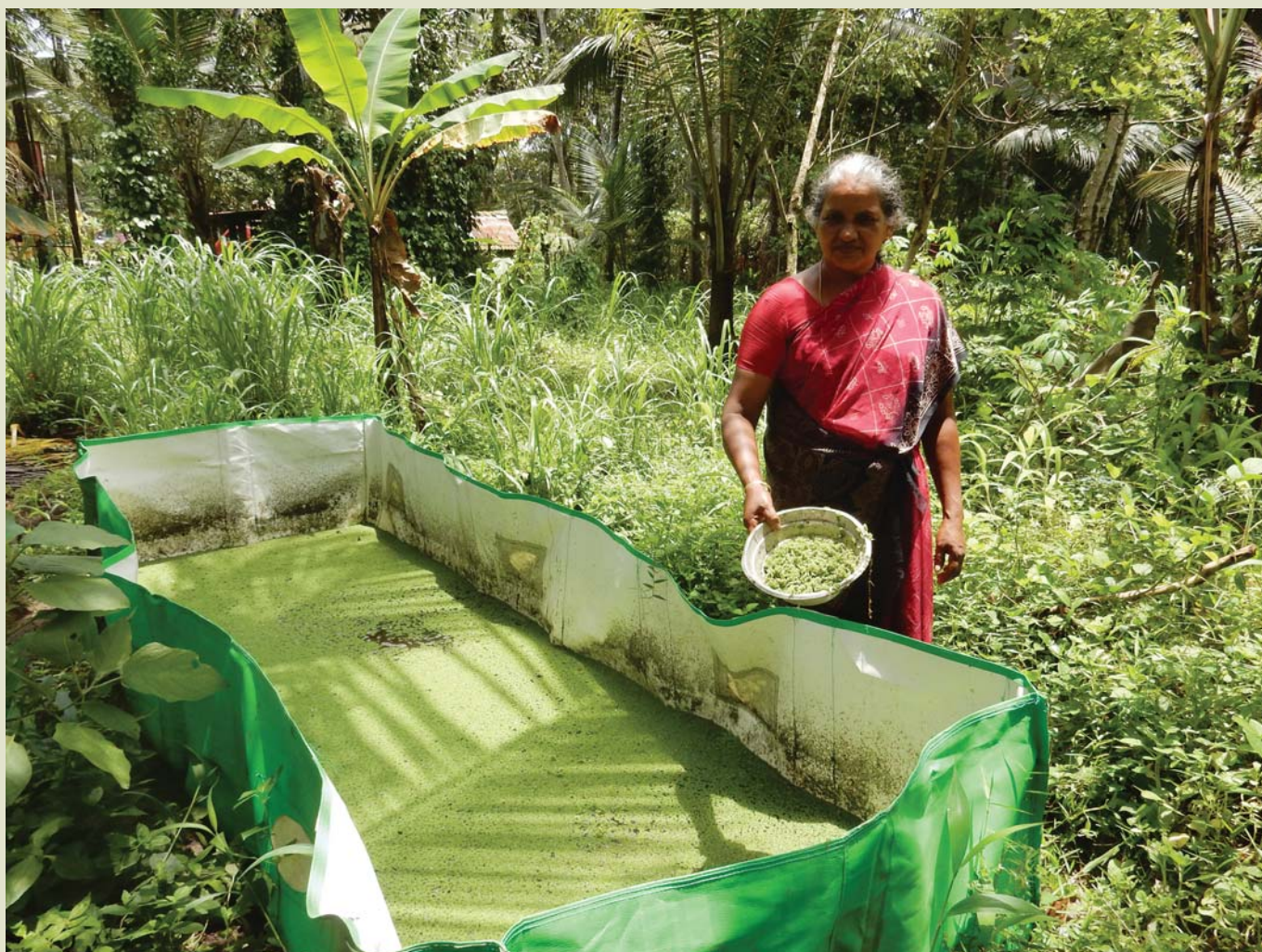
Azolla grown on farm is used as supplemental feed to livestock