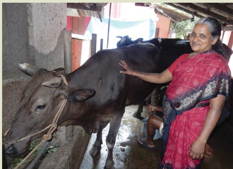
Returns from livestock adds to the family income

Indian Council of Agricultural Research- Central Plantation Crops Research Institute (ICAR-CPCRI) has been implementing several outreach and participatory extension research programme among farming community. Under its ‘Farmers FIRST’ programme