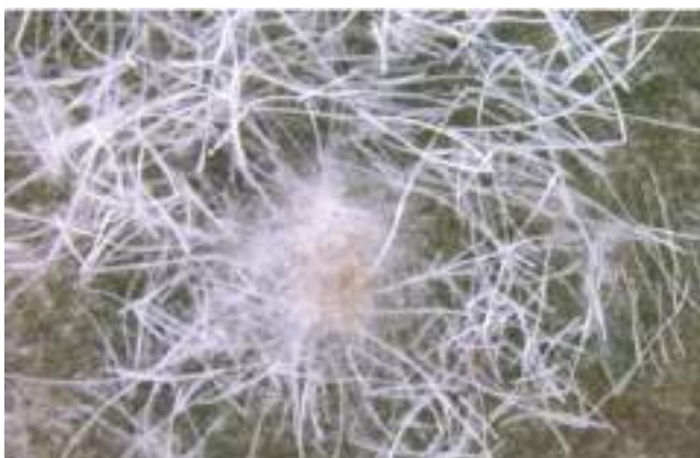
Fig. 5. Isaria fumosorosea infection on different stages of Paraleyrodes minei