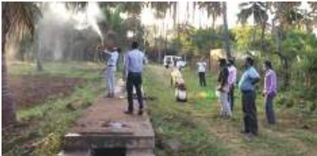
Fig.7. Field demonstration on Isaria fumosorosea at KRS, Mandya