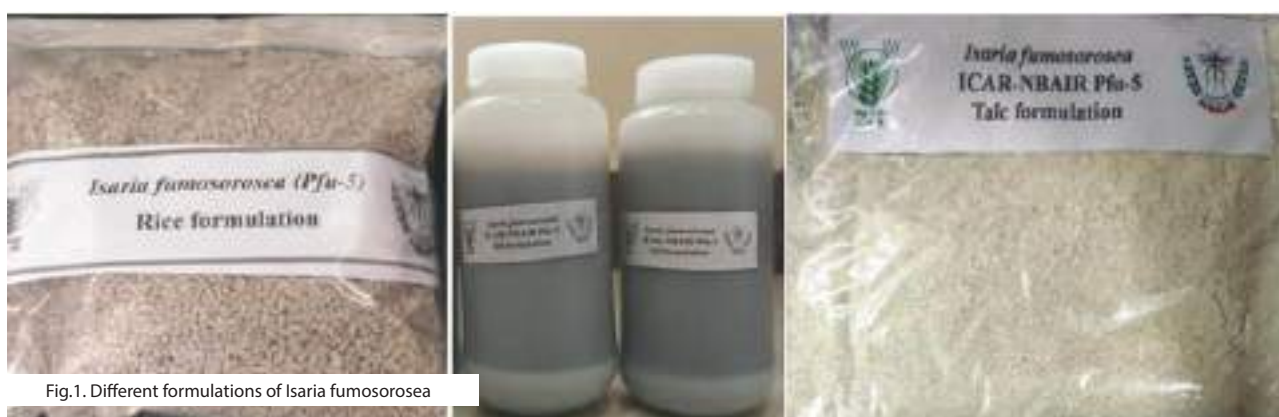
Fig.1. Different formulations of Isaria fumosorosea