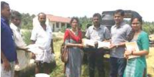
Fig.8. Field demonstration on Isaria fumosorosea at Pollachi