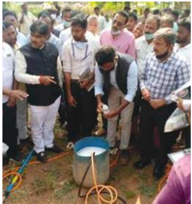
Fig.9 Shree R. Shanker, Minister of Horticulture and Sericulture, Government of Karnataka, briefing about Isaria fumosorosea to farmers and stakeholders

on BC centres for the field evaluation against invasive whiteflies in coconut. Besides, Nucleus culture of I. fumosorosea also distributed to FPOs, KVKs, Farmers, Agricultural universities and private organization for their mass production and distribution.