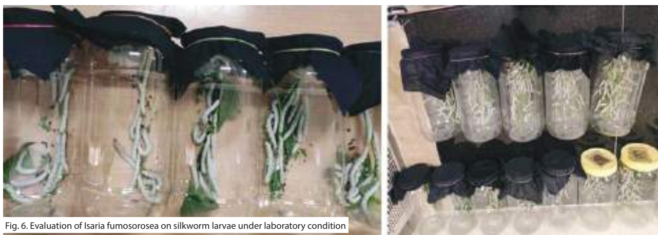
Fig. 6. Evaluation of Isaria fumosorosea on silkworm larvae under laboratory condition

reduction (67.57%) was significantly greater as compared to the untreated palms (5.50%) at 28 days after treatment. Similarly, the mortality of palm infesting whitefly was significantly higher (64.24%) in the treated palms as compared to untreated palms (5.52%) at 28 days after treatment on coconut in Karnataka.