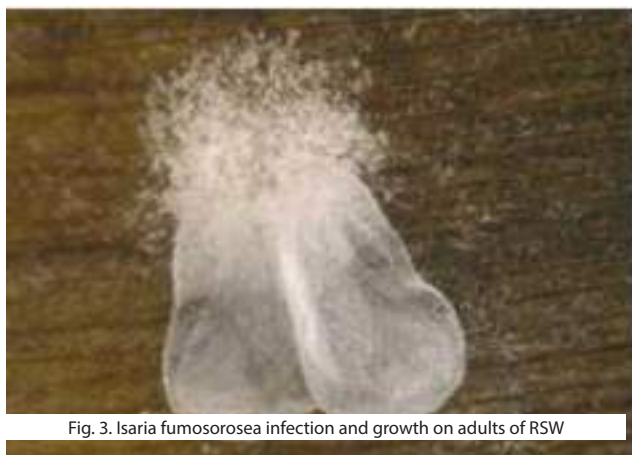
Fig. 3. Isaria fumosorosea infection and growth on adults of RSW