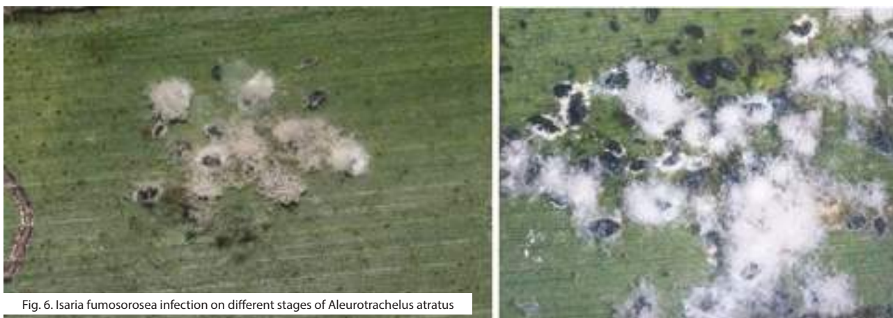
Fig. 6. Isaria fumosorosea infection on different stages of Aleurotrachelus atratus