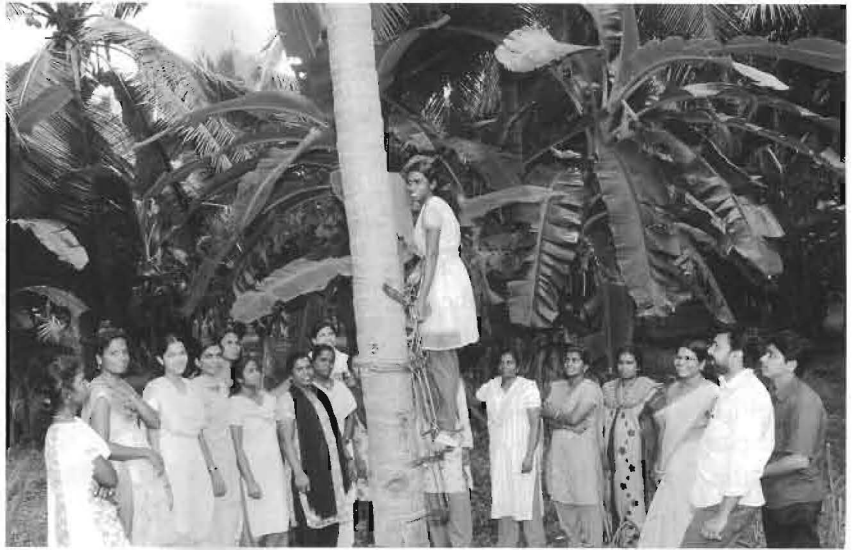
Women empowerment through FoCT training

Educational institutions could play a major role in the vision