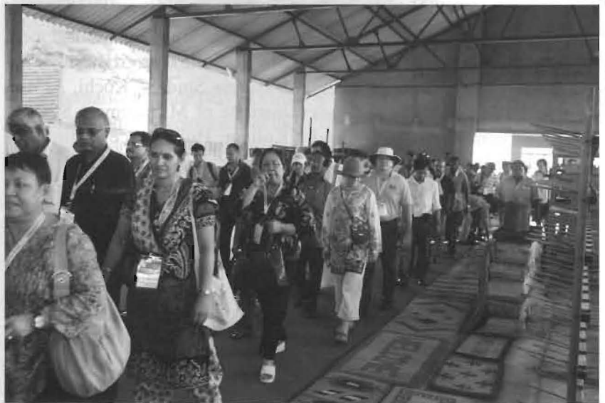
Experiencing India - delegates from abroad

Strategies in Coconut Farming and a farmers interface. A coconut Festival showcasing the technologies and products of various countries and institutions