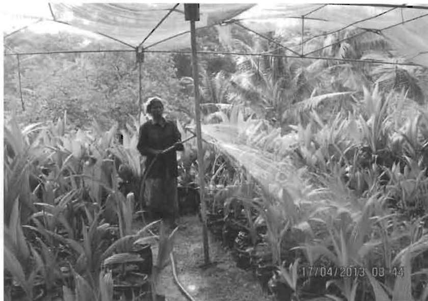
Production of quality seedlings - a thrust area

Board could got in hand many remarkable milestones, records and accolades by properly managing and utilizing the fund. Some of the remarkable achievements which left footprint in the year were implementation of rejuvenation scheme in the entire targeted area in Kerala and Andaman & Nicobar Islands and utilization of Rs.495.5 million against the originally envisaged budget provision of Rs. 320 million, coverage of 10,525 ha under laying out of Demonstration plots and utilization of 19 crores for the purpose of new planting in 2250 ha, production of 11 lakh seedlings in the Demonstration cum Seed Production Farms of the Board, starting of 29 new coconut based