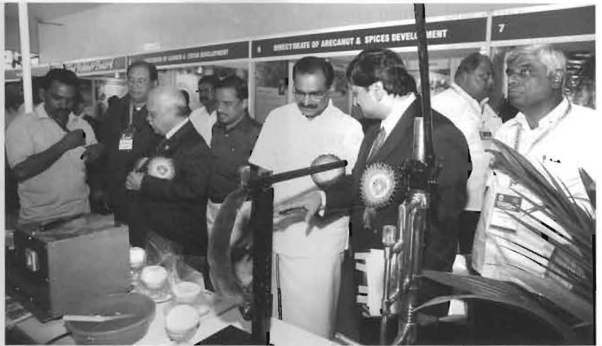
Coconut festival - showcasing products

It was a prestigious event in 2012-13 that India hosted an international event during 2-6 July, 2012 where 21 countries took part and exchanged the views and status of coconut growing in respective countries. The occasion was 45 th Cocotech meeting of the intergovernmental organization for the Asia and Pacific countries called APCC (Asian and Pacific Coconut Community) headquartered in Jakarta, Indonesia. The meeting which is held once in two years in