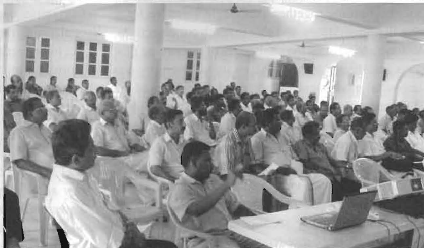
Empowering the group