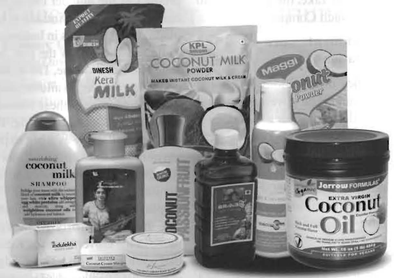
Value added coconut products

The demand for coconut products is countrywide. In the north and north-eastern parts of the country coconut consumers of various value added products are on the increase. Non availability of the emerging products put hurdles to their popularization. Efforts of the Board on awareness creation on pan India basis yielded fruitful results. In order to make available the products at least in 63 JnNURM cities a new and innovative marketing strategy had been initiated by the Board during the year through the well distributed marketing team placed in the potential cities and also through the state centres and regional offices which can undertake market promotion activities in the adjacent cities. The idea that 10 nascent products were presented in a product basket was also the unique idea of the year. Products like tender coconut water, coconut cream, coconut milk, coconut milk