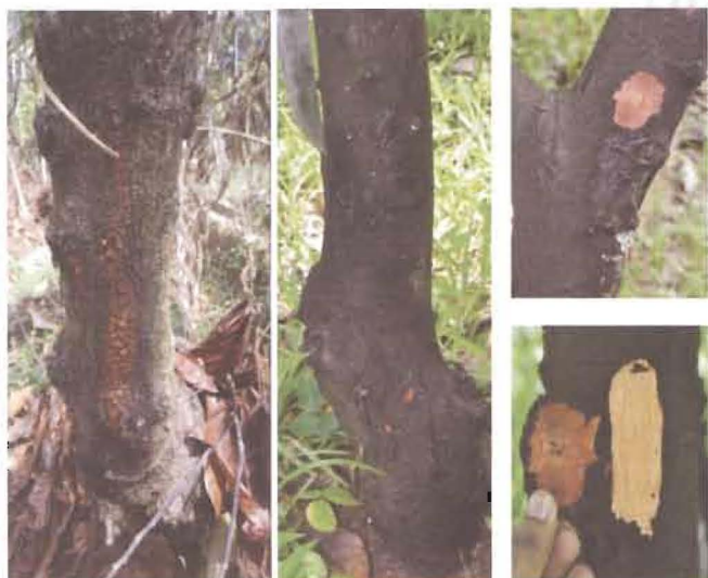
Fig. 1. Canker lesion on the stem Fig. 2. Oozing from the stem canker lesion Fig. 3. (a) Infected bark show discoloration as compared to healthy bark