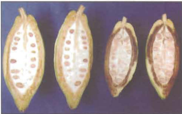
Fig. 4. Sequence of treatment to stem canker infected bark