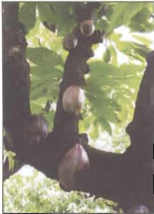
Fig. 3. Vertical spread of black pod disease