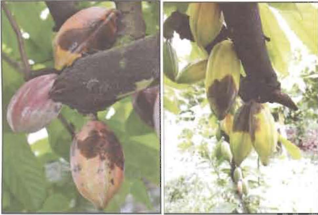
Fig. 1. Initial water soaked lesion on the pod surface