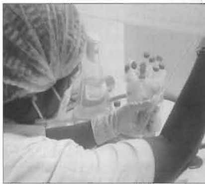
Preparation of anti ferment solution for neera tapping

Important things to keep in mind while tapping neera is that the palms shall be healthy and the tapper should be skilled. Careful supervision shall be ensured from tapping to packing and everything