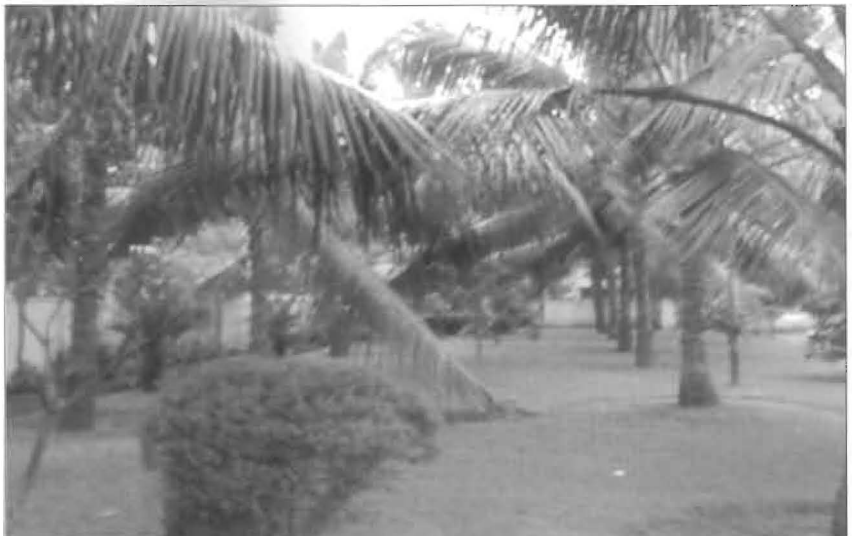
Neera tapping site of CIT at Nedumbasserry

The cut spathe shall be tied with coconut leaf or a rope and cover the face of spathe with sterilized clay. It helps in extracting more neera. The sap begins to ooze out after 15 days from beating the flower bud which can be collected twice daily. Same steps are repeated daily—cutting, beating, clay application etc. Tappers need to keep hygienic condition in each step of tapping and they must put anti ferment solution into neera collecting container after tapping.