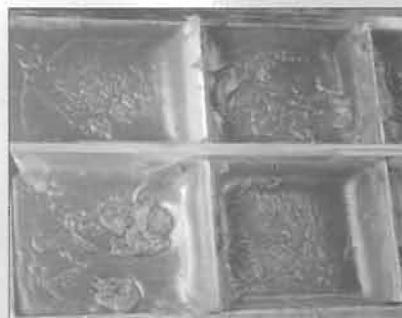
Jaggery along with Mould

frequently cleaned. The application of sterilized clay with disposable hand gloves shall be ensured and the collecting vessel