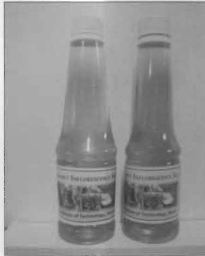
Neera packed by CIT

For ensuring the hygienic condition, prevent the contact of microbes with inflorescence by using disinfectant ( three times in a day). Collecting vessels shall be