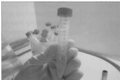
Container filled with anti ferment solution

shall be done under strict hygienic conditions.