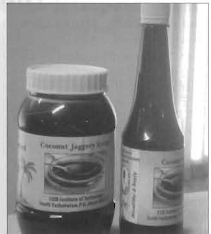
Final Stage of packing