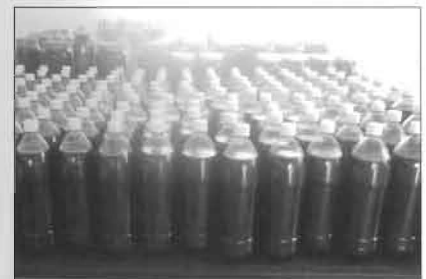
First Stage of Bulk Packing

must contain anti-ferment liquid at appropriate level.