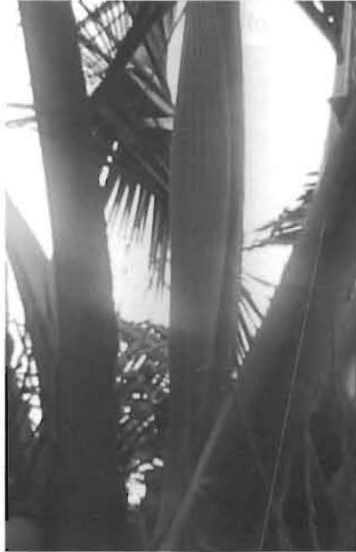
Swelling Base (ready for tapping)

The female flower within the unopened spadix causes a swelling at the base and its appearance indicates the appropriate stage for tapping. The yield of sap gradually increases and when it reaches the maximum, the collection is made twice a day. The flow of the sap from the inflorescence continues for about two months or even more. After one month from the tapping of first inflorescence, the second spadix is also brought into production. The tapping is usually