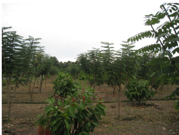
Fig. 2. Cocoa (13 months after planting) and shade trees position.

Rootstock × scion combinations showed highly variable of VSD incidence or severity. VSD disease symptoms emerged variably according to the combination of rootstock and scion from five until 16 months after planting. There is an effect of the scion (factor 1) on VSD incidence and severity where the influence was highly significant at the mid and final of evaluation (12,15,18 months after planting) whereas rootstock (factor 2) and interaction (scion × rootstock) effect were not significant in any evaluation event. However, at the beginning of the evaluation (six and nine months after planting), the mean incidence of the scion, rootstock and interaction (scion × rootstock) was not significantly