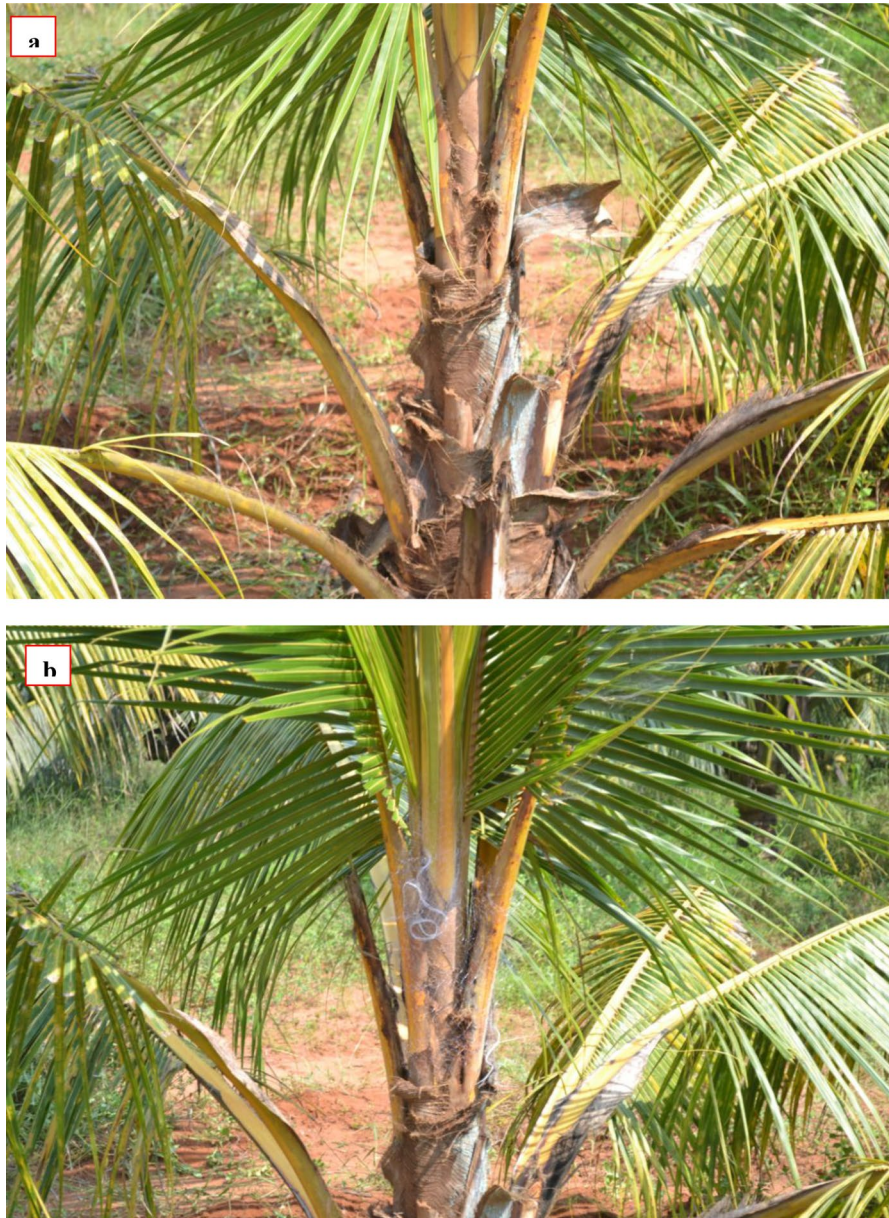
Figure 1. Nylon net wrapping as a physical barrier against rhinoceros beetle in the three-year-old juvenile palms in the field; above image without nylon net and below image with nylon net.

( N=20 ) was carried out using measuring scale to ascertain the most effective net which can also serve as passive trapping tool. The head, neck and abdomen width and length of the trapped beetles were analyzed. The experiment was repeated in juvenile palms planted in 2015 ( N=120 ) during June 2018 to December 2018. However, only net with mesh size of 3.2 \times 3.2 cm (0.12 mm thickness) was used which was found as most effective in our preliminary studies. Sex determination of the trapped beetles was done based on their horn size (supplementary file). The costs required for nylon nets use were compared with that related to recommended plant protection measures for managing rhinoceros beetle in coconut to estimate relative economic benefits. The cost estimate was made on a per hectare basis