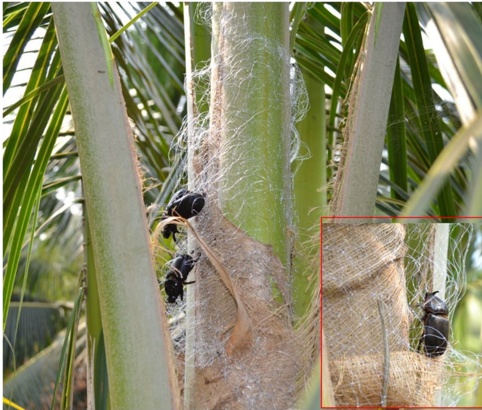
Figure 3. Entangled adult beetles in the nylon net wrapping on juvenile palms (three–four year old); Close up view of entangled beetle in the net (insert).