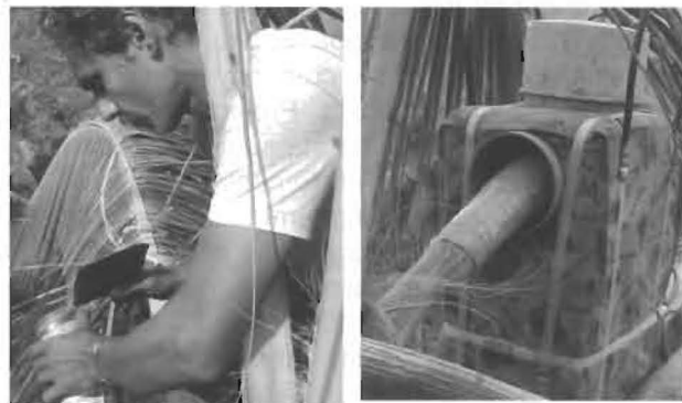
Neera tapping process