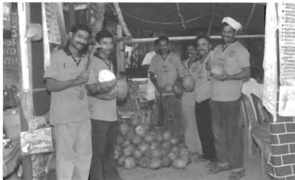
FoCT's involved in tender coconut harvesting and its sale

Eco farm tourism promotion attracts tourists from different destinations across the country and abroad for enjoying and experiencing the agriculture activities at farm level and for tasting delicious local cuisine prepared from organically grown vegetables and cereals. Company is planning to engage around 300 genuine and interested organic coconut farmers as part of eco farm tourism project. Such farmer groups will offer accommodation and food in the farm itself so that the guest can observe and involve in