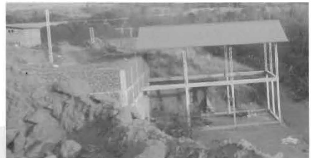
Cost effective construction of integrated complex.

in the unit. Expeller unit is having the capacity to process 800 kg copra per hour. The project cost of integrated coconut complex is Rs. 2.70 crores. A jack fruit processing unit is also planned in the integrated complex with the financial assistance of Khadi and Village Industries Commission (KVIC) where in jack fruit chips, pulp; sweets are available. 50% of diversified products will be recycled to the producers (Farmer groups) for consumption and local sale and 50% will be utilized for export purpose. They are planning to start virgin coconut oil, DC and coconut milk units as 2 nd phase. The profit of the company