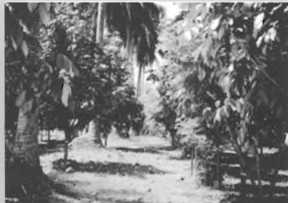
Ecosystem 6: Coconut + Lanzones fruit tree ( Lansium domesticum L)