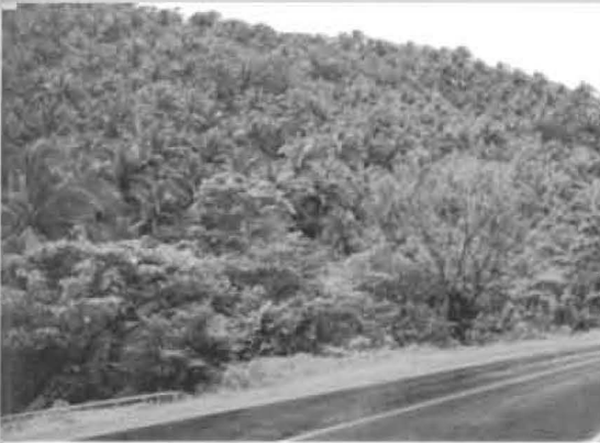
Ecosystem 3: Dominant coconut trees in sloping and hilly lands.