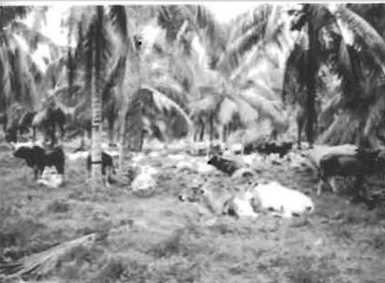
Ecosystem 5: Coconut + Livestock (cattle grazing).