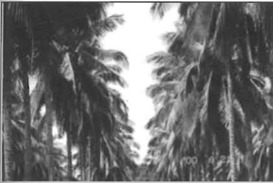
Ecosystem 1 : Coconut Monocrop Plantation.