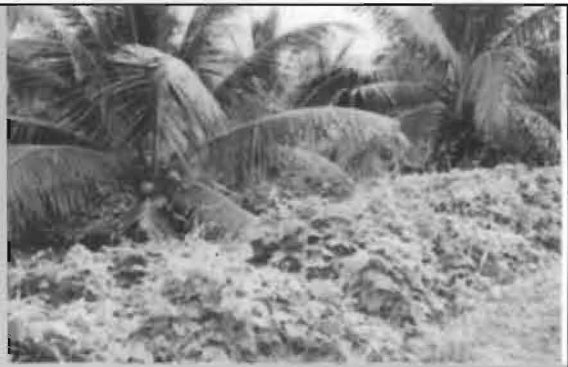
Ecosystem 2 : Coconut with legume covercrop (kudzu + centrosema.)