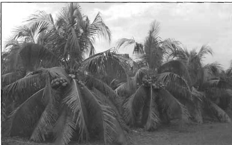
A View of Coconut Plantation

As agriculture is both a cause and victim of climate-change, the solution of climate-change caused by agriculture depends on selecting the best agriculture or farming practices to provide the cost-effective agricultural production system with minimum adverse effects on the environment, particularly its resultant climate. Coconut farming and/or coconut agro-ecosystem is one of the major agricultural sectors/systems in the country since the post-Spanish regime. Also, the landscape of the Philippines from the seacoast to elevated uplands and low mountains had been devoted to coconut farming and coconut agro-ecosystem as one of the major cropping/system in the country had been dominated by rice lands, corn lands and coconut lands with around 3.3 million (M) ha for decades