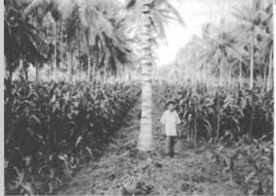
Ecosystem 4: Coconut + corn (maize).