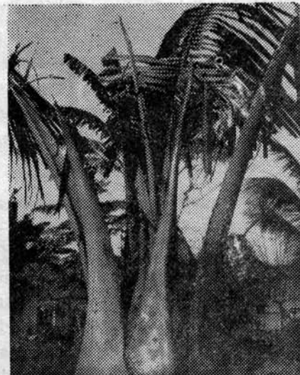
Fig. 4 Stick-like leaves in advanced stage of disease