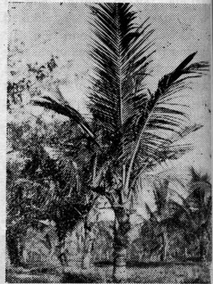
Fig. 6. Emergence of healthy leaf in crown choke affected palm (10 year old) after application of borax

Crown rot or crown choke disease prevalent in Assam and West Bengal is a disorder due to boron deficiency. It can be cured by the application of 50 g of borax (sodium tetra borate) along with