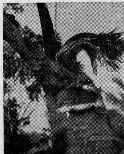
Fig. 5. Rotting of primordial tissue in acute case of disorder

No fungal or bacterial pathogen could be isolated, although a culture of saprophytic bacterium was observed. The possible viral origin was also studied. Transmission through sap and mealy bug failed to produce symptoms.