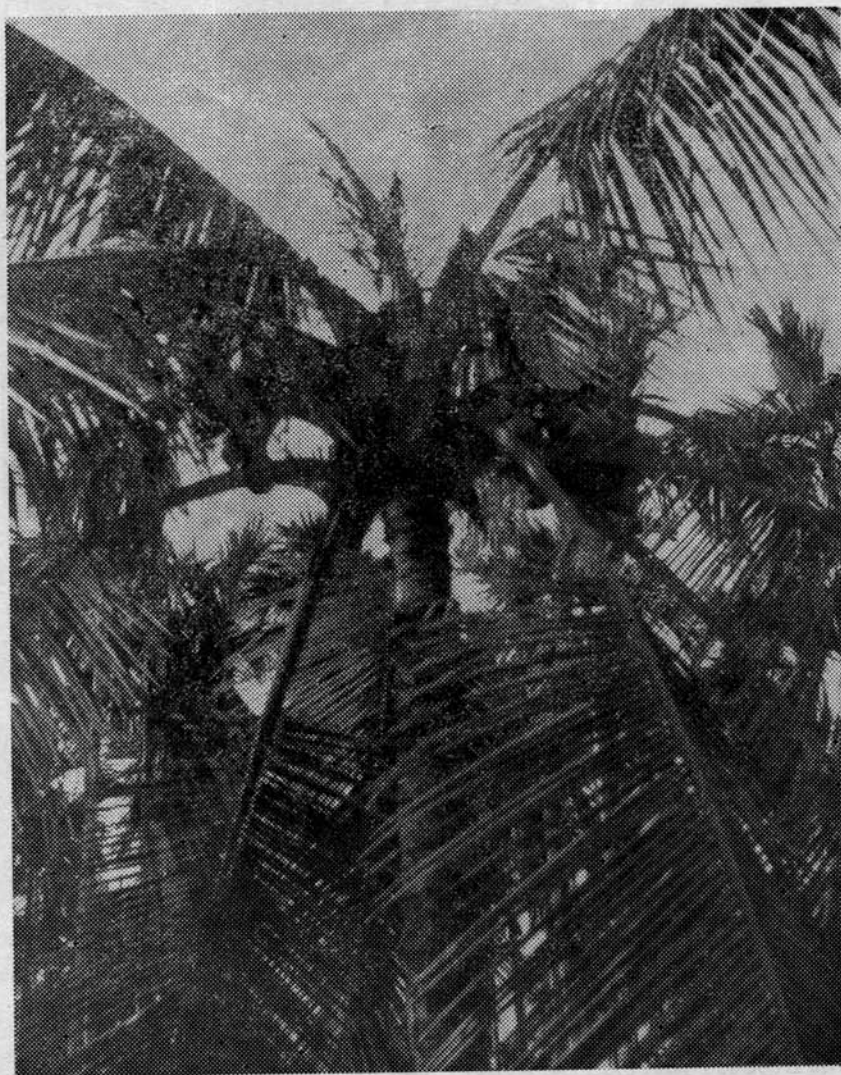
Fig. 1. A 15 year old coconut palm showing the symptom of crown choking

An unidentified disease of coconut on two young palms was noticed at the Regional Coconut