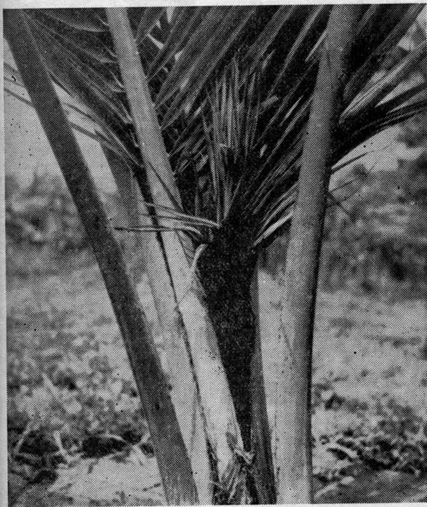
Fig. 3. Choking of young leaf in a two year old palm

ordial tissue takes place (Fig. 5). The stem does not taper below the crown. The death of the affected palm is not sudden but it slowly loses vitality and finally succumbs to disease within 3 to 4 years. Roots of affected palms remain healthy and normal. Natural recovery of the palms is very rare. Mealy bugs are often associated with the diseased palms.